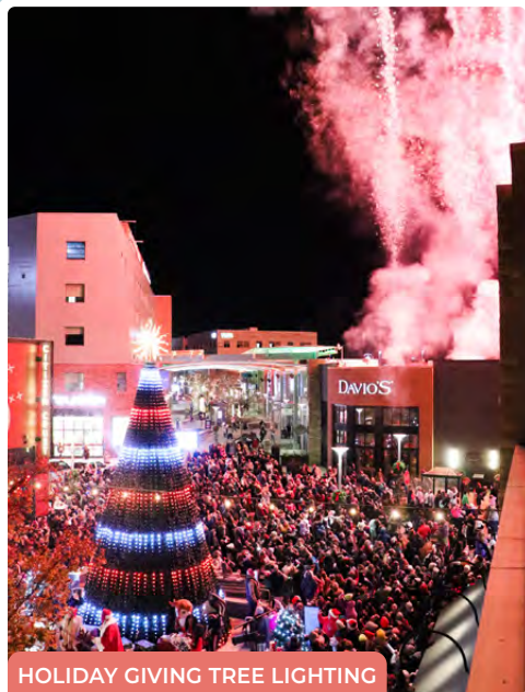
HOLIDAY GIVING TREE LIGHTING