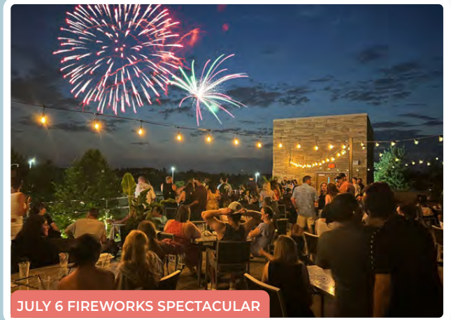
JULY 6 FIREWORKS SPECTACULAR