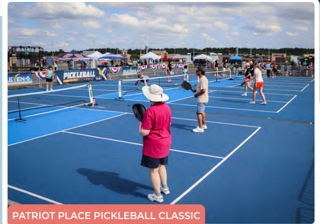
PATRIOT PLACE PICKLEBALL CLASSIC