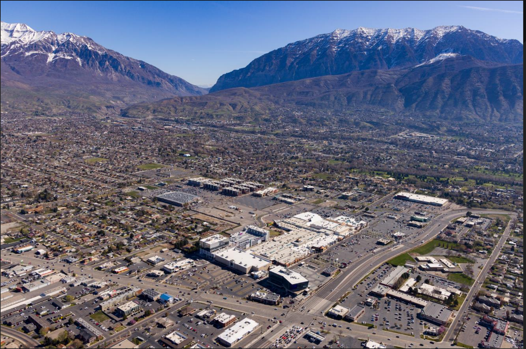
UNIVERSITY PLACE | 575 E. UNIVERSITY PARKWAY | OREM, UT