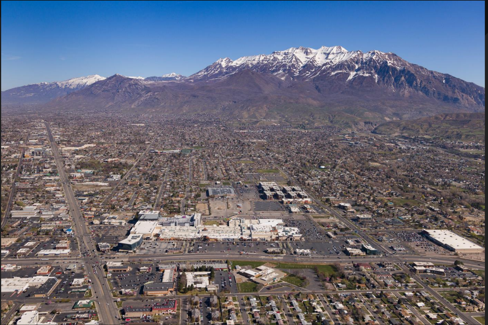
UNIVERSITY PLACE | 575 E. UNIVERSITY PARKWAY | OREM, UT