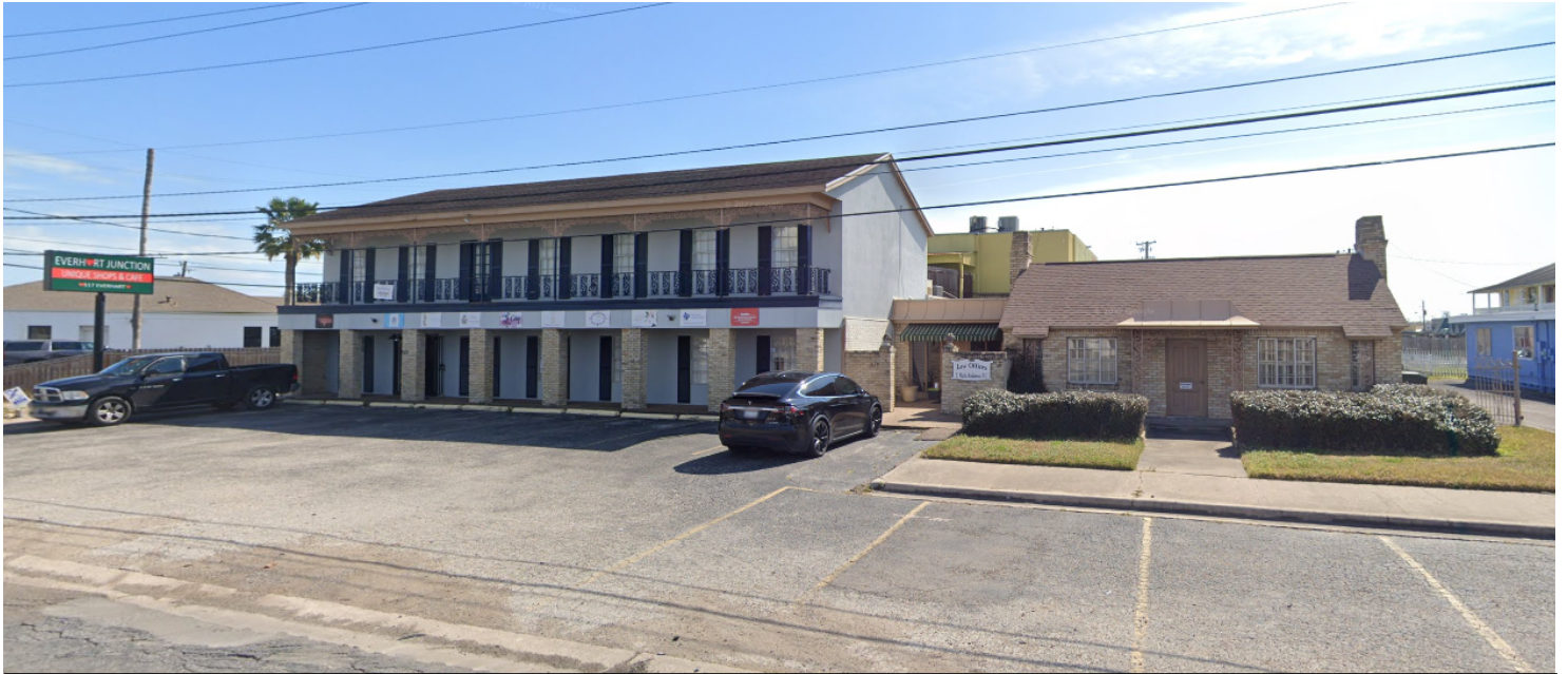
517, 519 Everhart