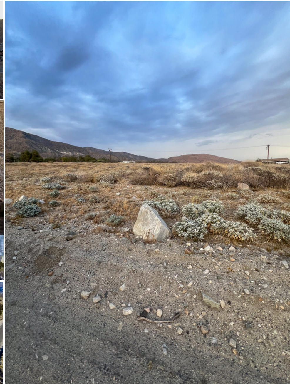
Outlines are approximate

KATE RUST kate@meadecommercial.com 760-409-1532