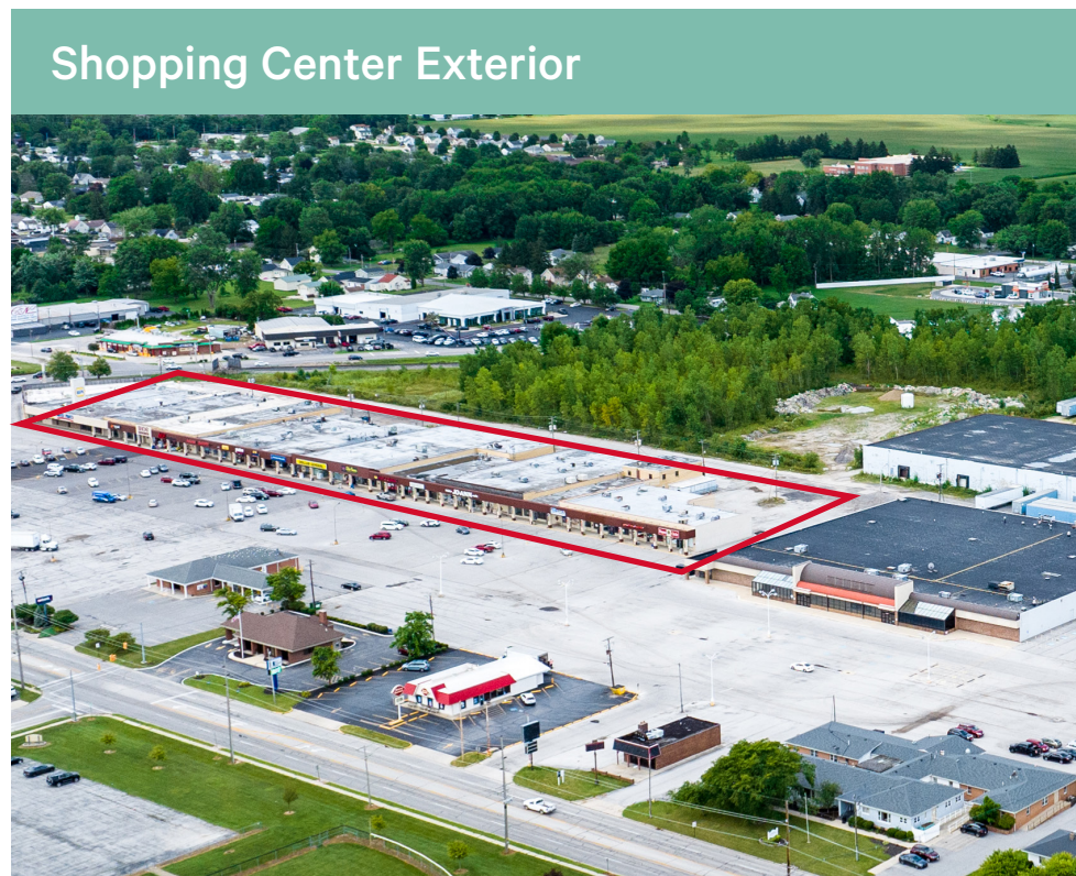
Shopping Center Exterior