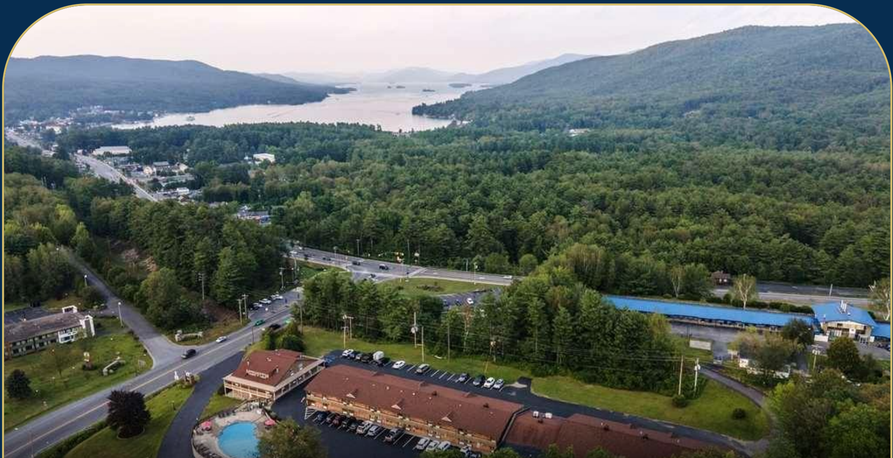
Best Western of Lake George