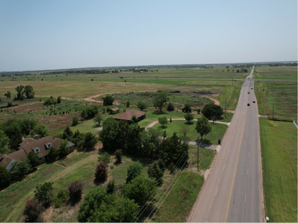
Elk View West