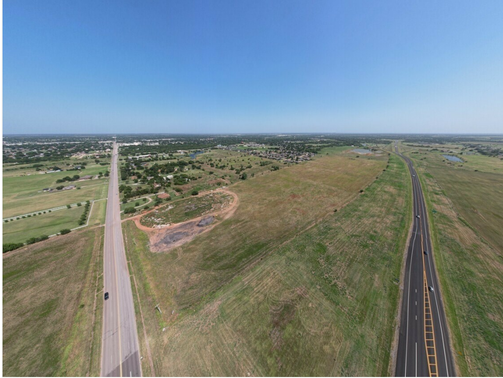
Aerial of 3608 W Elk Ave