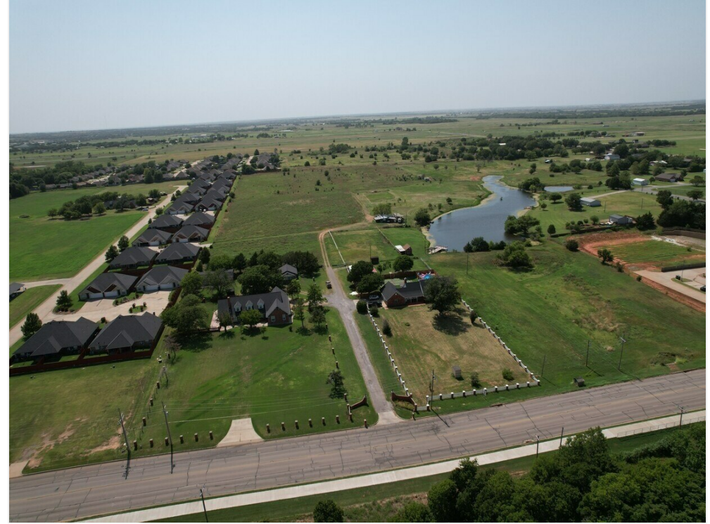
Public Roadway to Chisholm Parkway