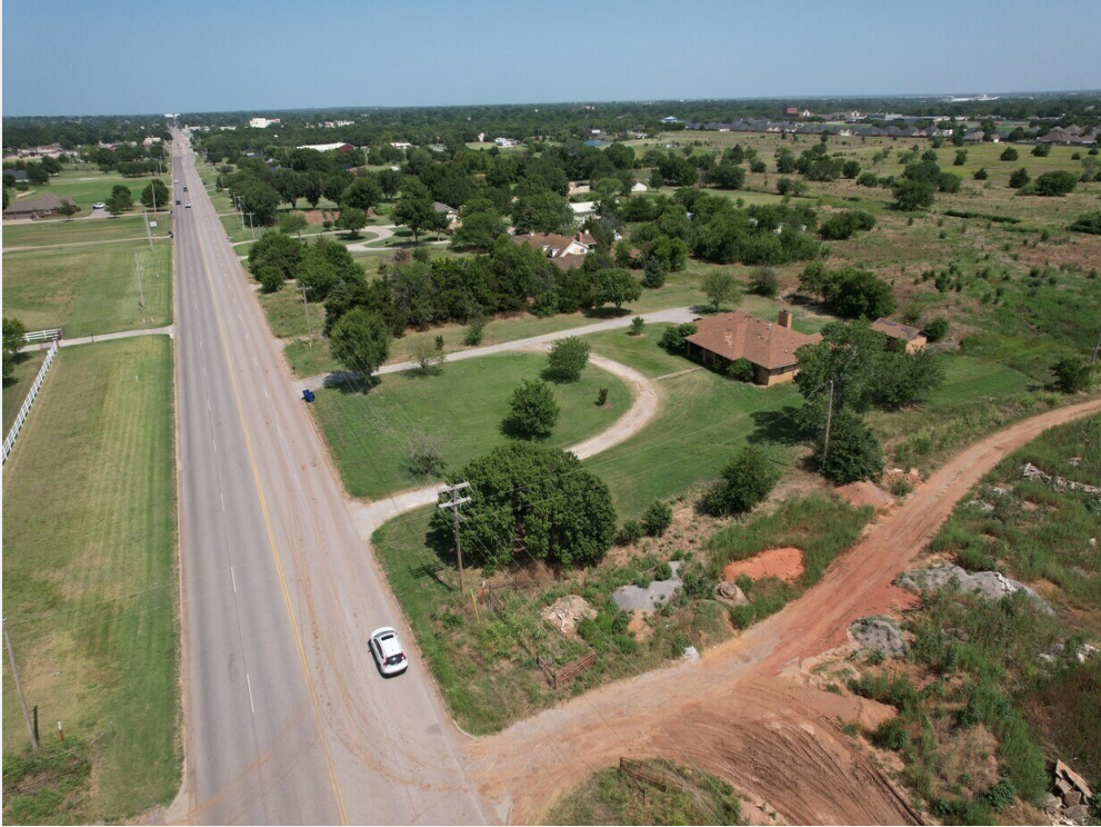
Elk View East