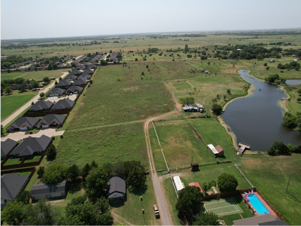
Public Roadway to Chisholm Parkway