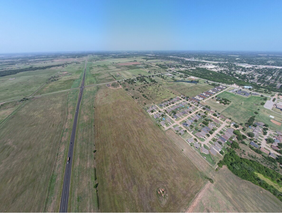
SE looking to north/ elk