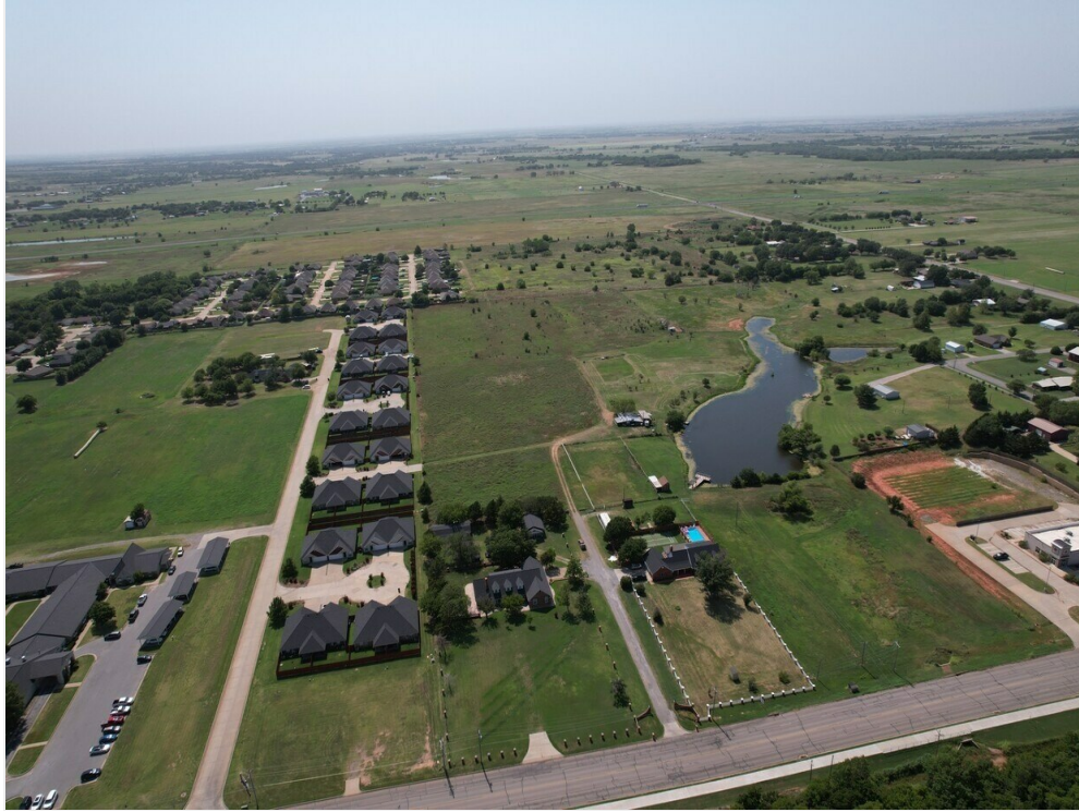
View from Chisholm Parkway