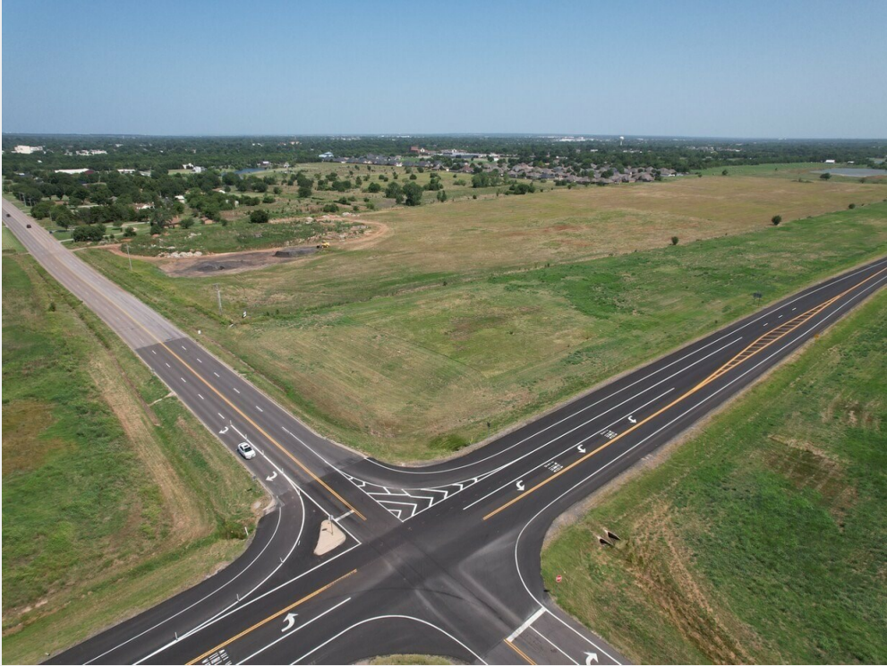
Aerial of 3608 W Elk Ave