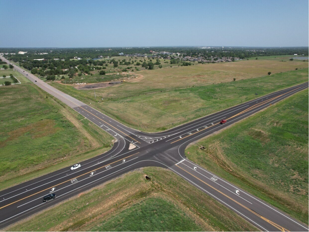
Aerial of 3608 W Elk Ave