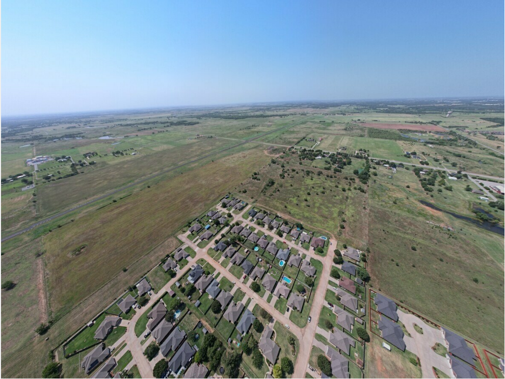
Location to Bypass and housing