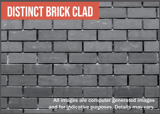
DISTINCT BRICK CLAD

All images are computer generated images and for indicative purposes. Details may vary.