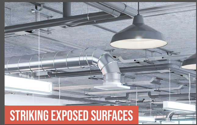
STRIKING EXPOSED SURFACES