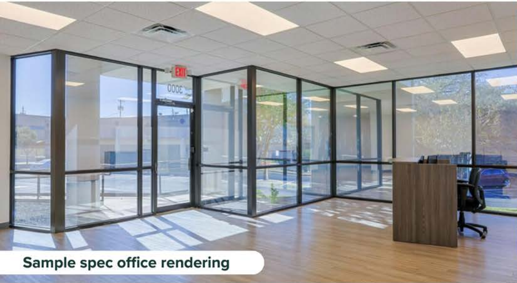
Sample spec office rendering