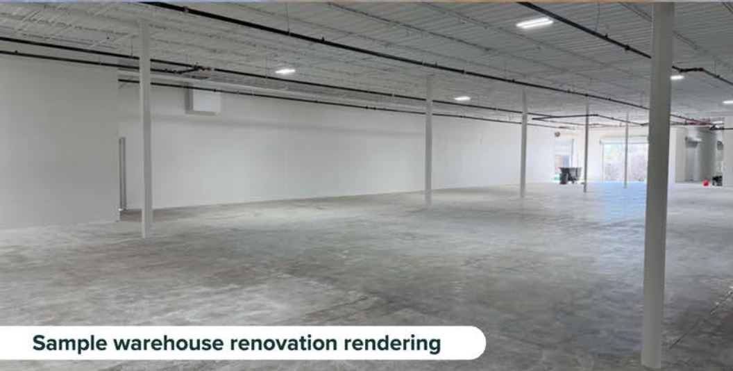
Sample warehouse renovation rendering