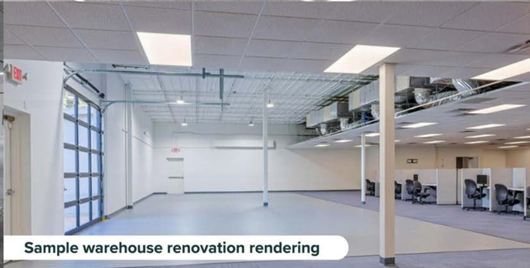
Sample warehouse renovation rendering