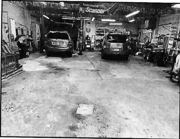
PHOTOGRAPH 1: View of the cleaned concrete slab at the interior of the garage structure at 1132-1134 East Columbia Avenue.