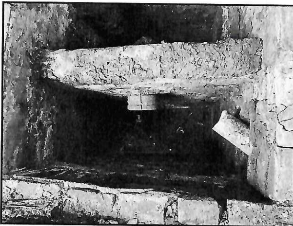
PHOTOGRAPH 3: View of empty OWS at the interior of the garage structure at 1132-1134 East Columbia Avenue.