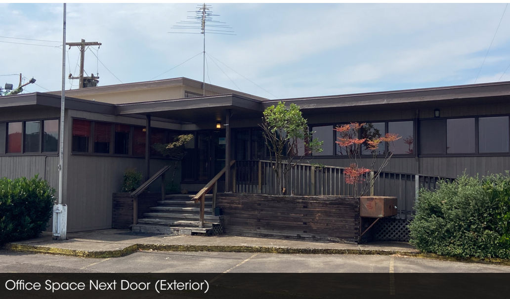
Office Space Next Door (Exterior)