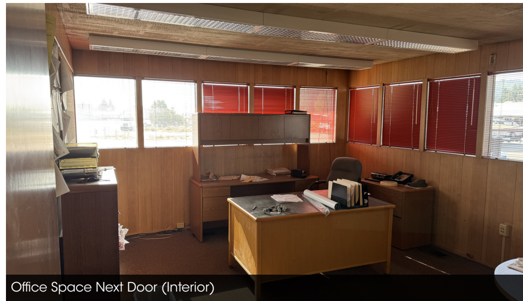
Office Space Next Door (Interior)