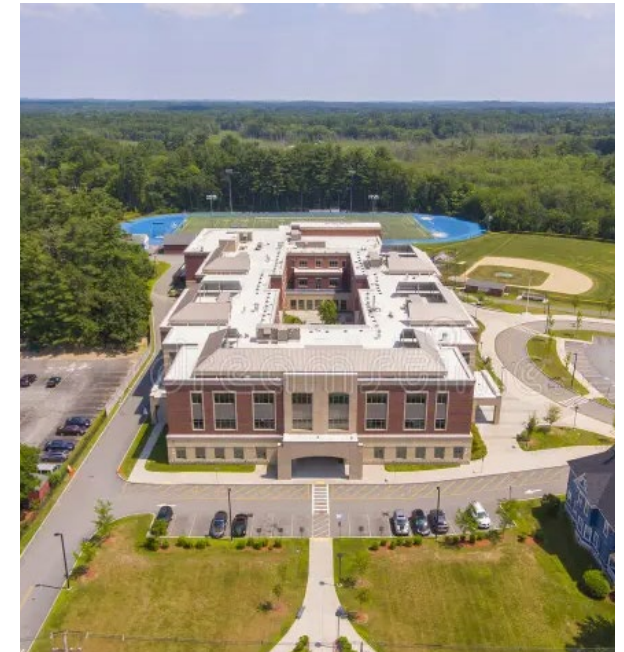
Wilmington Historic Town Center

Wilmington balances suburban growth with community amenities such as parks, conservation areas and local recreation facilities. Its location, transportation access and residential character make it a stable component of the northern Boston suburban market, with ongoing appeal for both families and commuters.