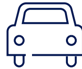
High traffic location