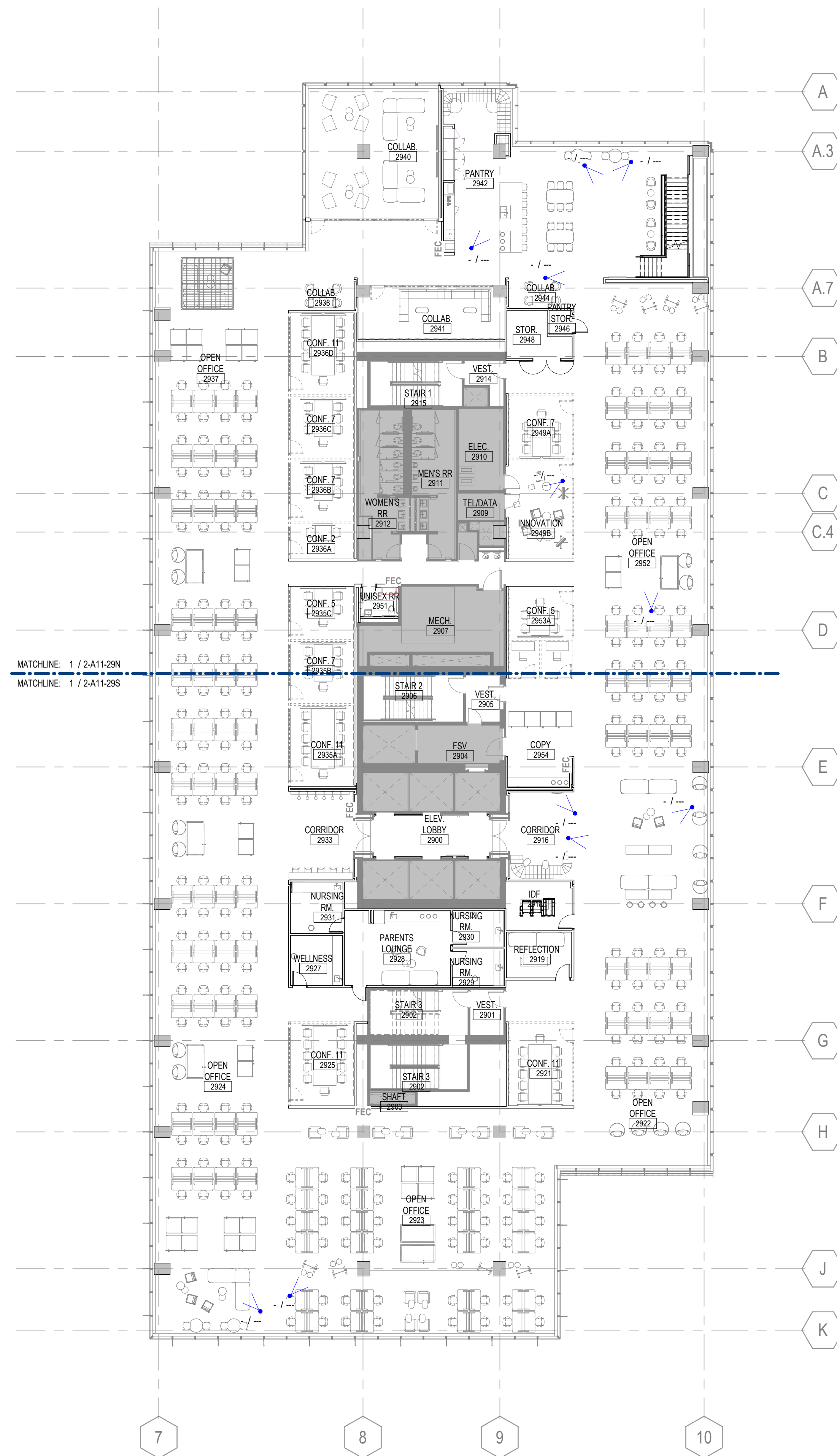
1 OVERALL FLOOR PLAN - LEVEL 29 1/16" = 1'-0"

4/12/2022 2:34:30 PM BIM 360://indeed - Block 71 - 200 West 6th Street/ARC/Indeeds-Austin/BT1-RZ1.rvt