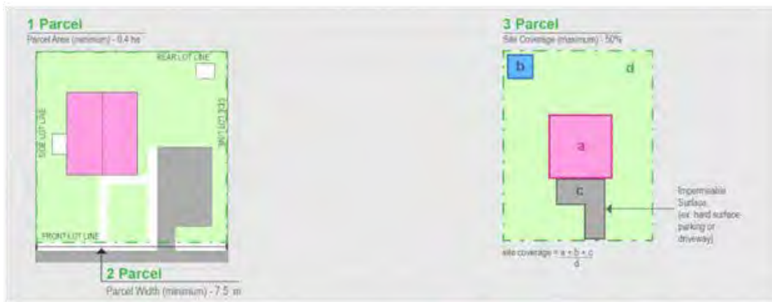
FIGURE 17: COMMUNITY FACILITIES DISTRICT (CF) REGULATIONS