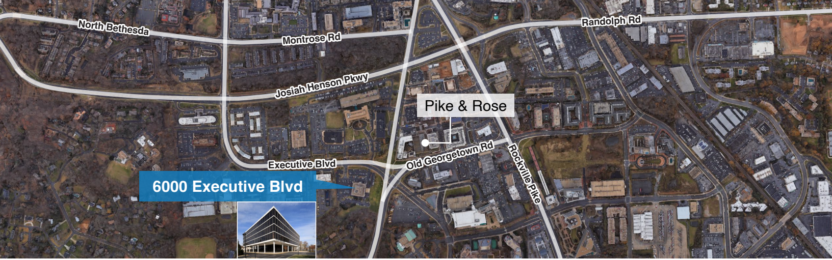
Suite 510: 7,188 RSF Former Orthopedic & PT Space