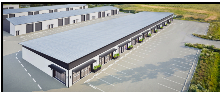
Building B— Frontage Retail Directly on the frontage of Spring Stuebner Rd.

A \pm 2,700 SF retail space offering high ceilings, allowing for flexible build-out options, including a mezzanine or a full-height sheetrocked-to-deck finish.