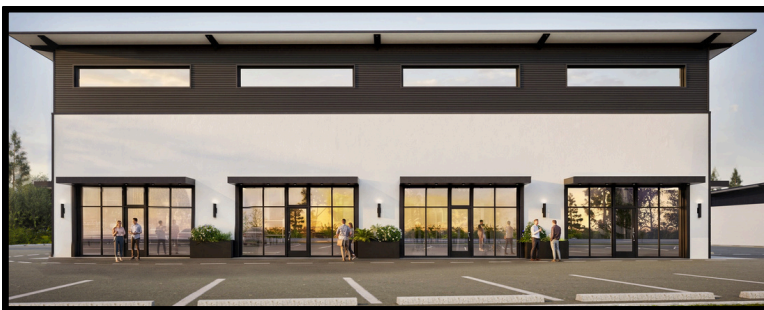
Building A — Frontage Retail Tower Space Corner of Rhodes Rd. & Spring Stuebner

Retail Base Rents: $24.00 - $32.00 per SF/YR Plus estimated NNN expenses of $3.00 per SF/YR