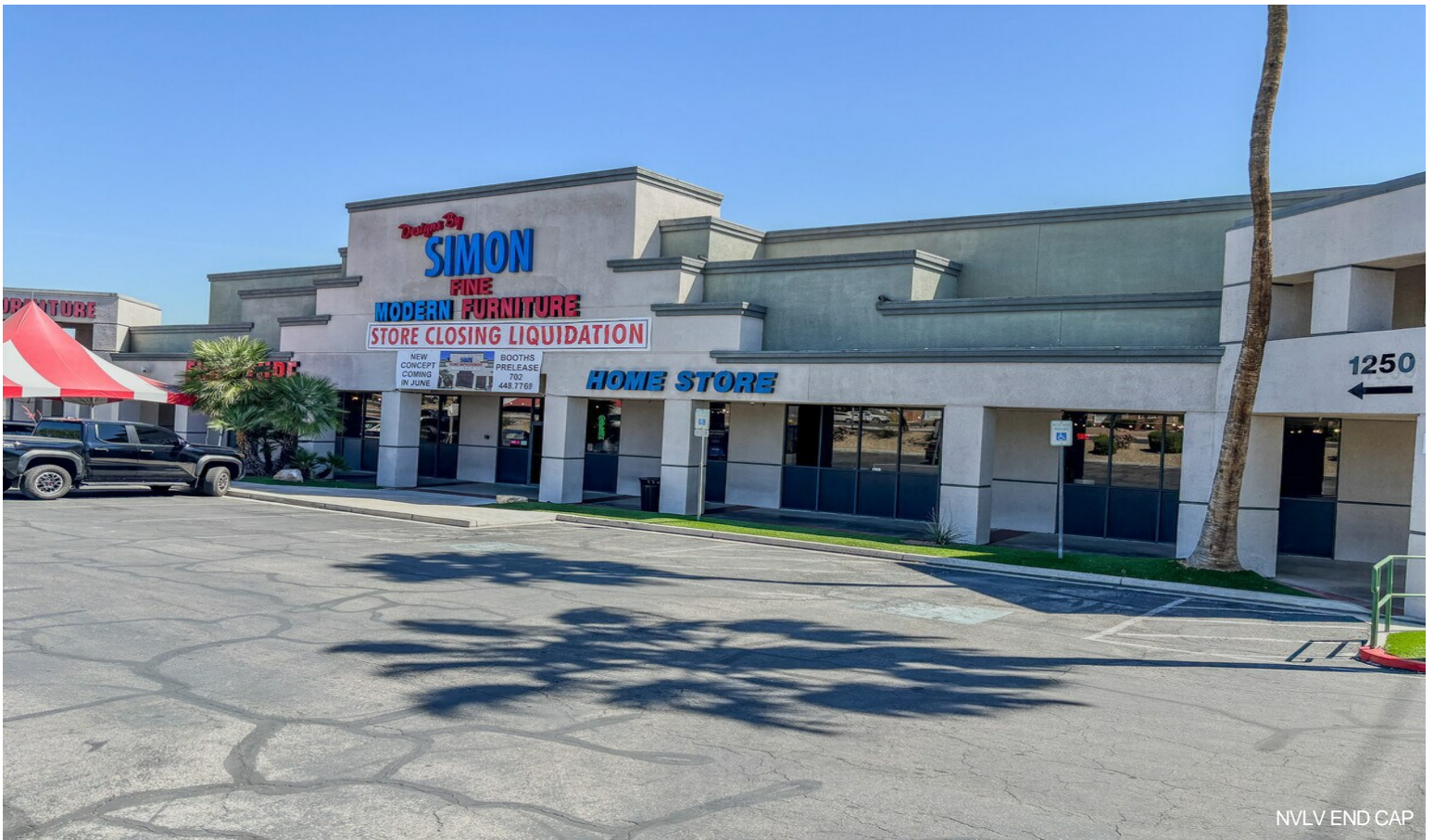
NVLV END CAP