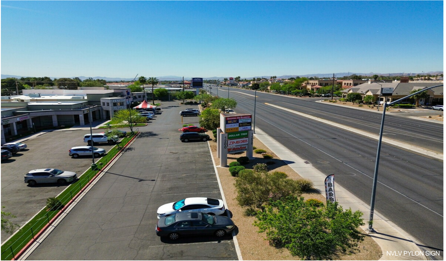
NVLV PYLON SIGN