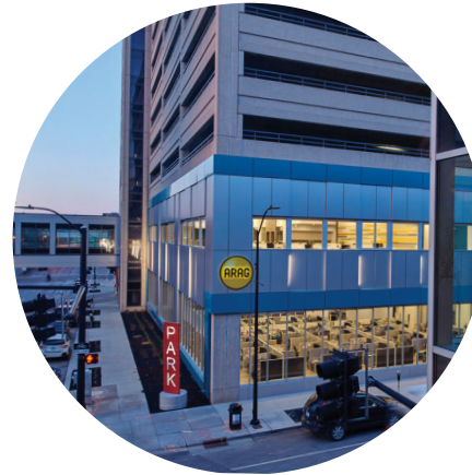
newly renovated exterior