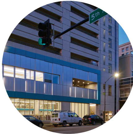
street level presence