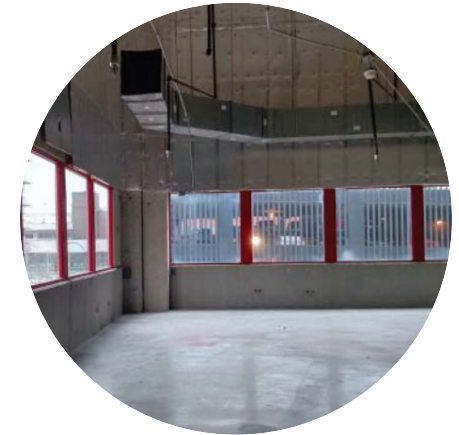
start with a clean slate