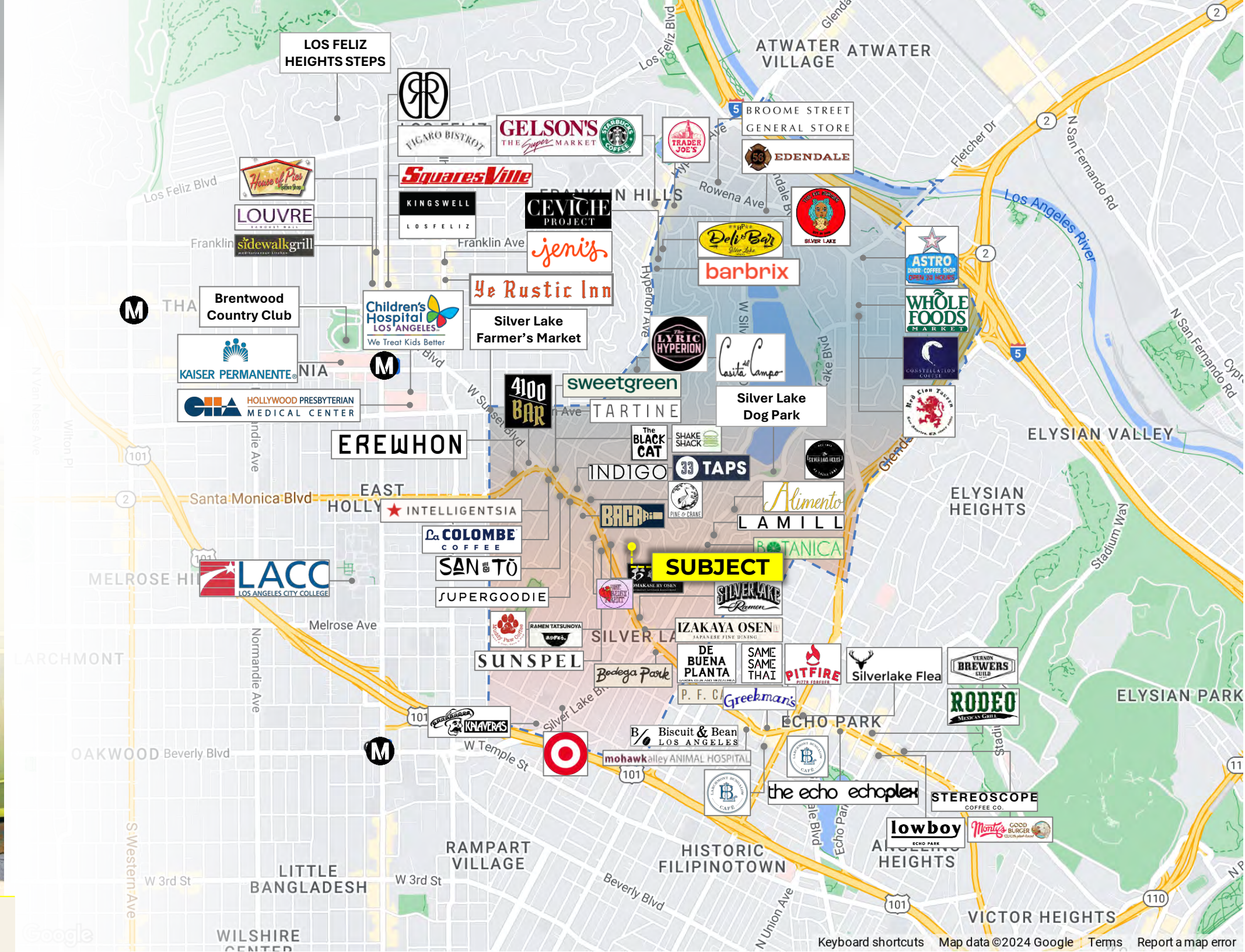
Silver Lake | Virgil Village