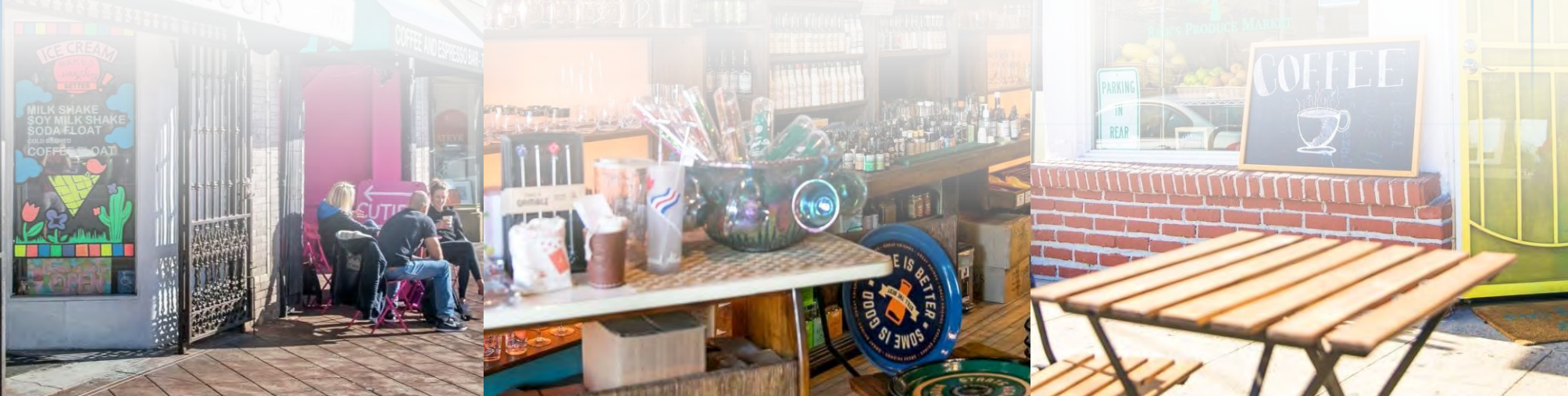
4326 Gateway Avenue

Virgil Village offers exceptional connectivity throughout Los Angeles, positioned just minutes from Sunset Junction, Griffith Park, Hollywood, Downtown Los Angeles, Koreatown, and Larchmont Village. Its central location, growing amenity base, and increasing popularity have transformed the neighborhood into one of the city's most desirable rental markets, attracting a diverse mix of professionals, creatives, and long-term residents seeking convenience, culture, and accessibility.