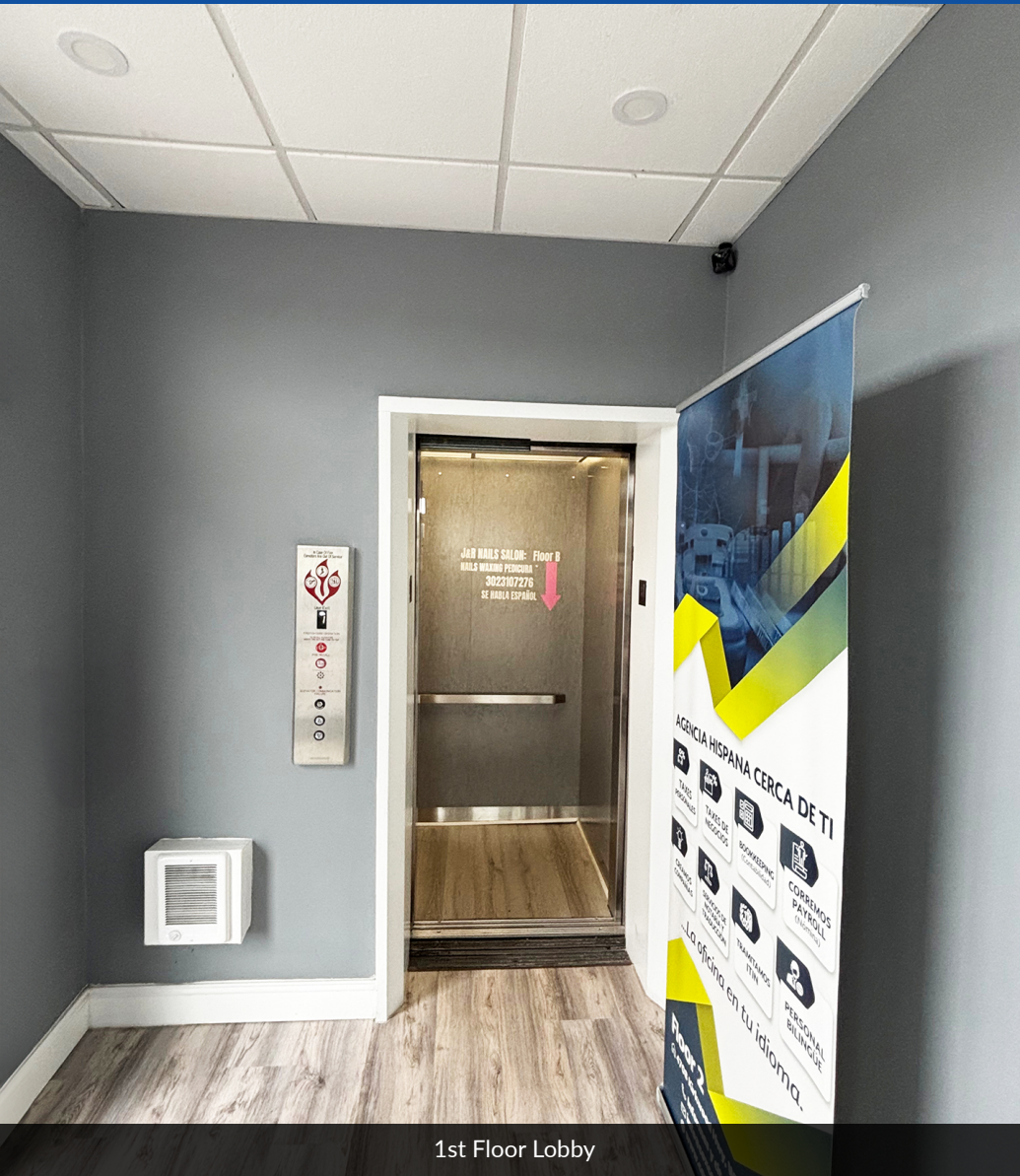
1st Floor Lobby