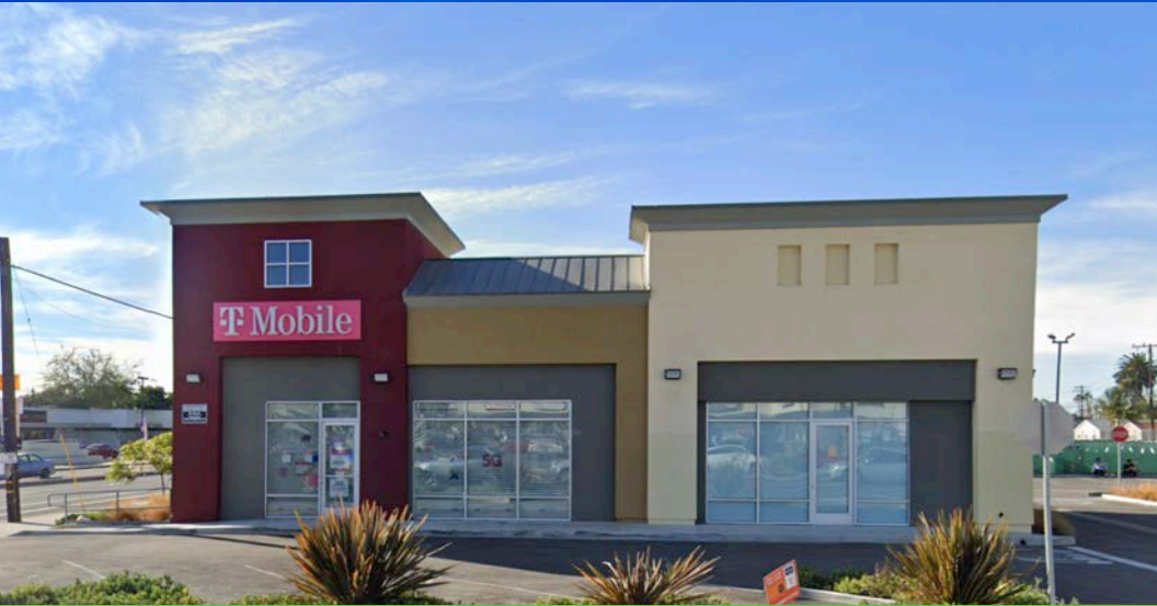
PAD D Corner Pad (Facing Wilmington Ave.)