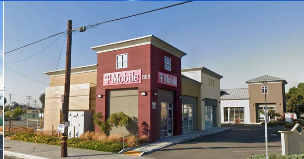
PAD D Corner Pad (Facing Rosecrans Ave.)