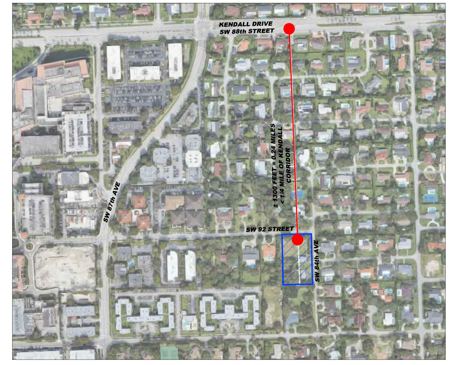
Location Map NTS