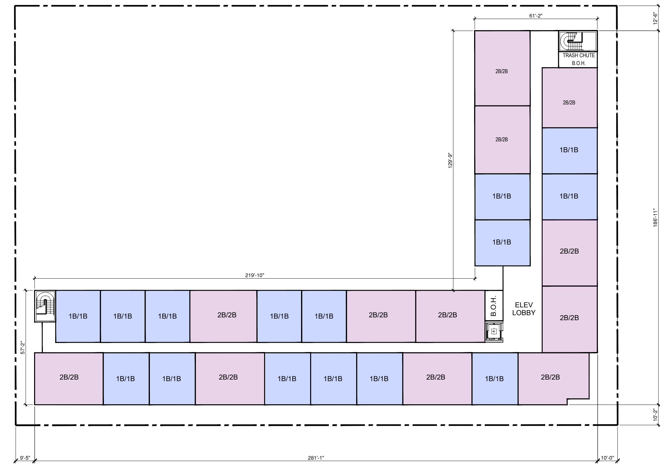
Second & Third Floor Plan 1"= 30' 27 DWELLING UNITS / FLOOR