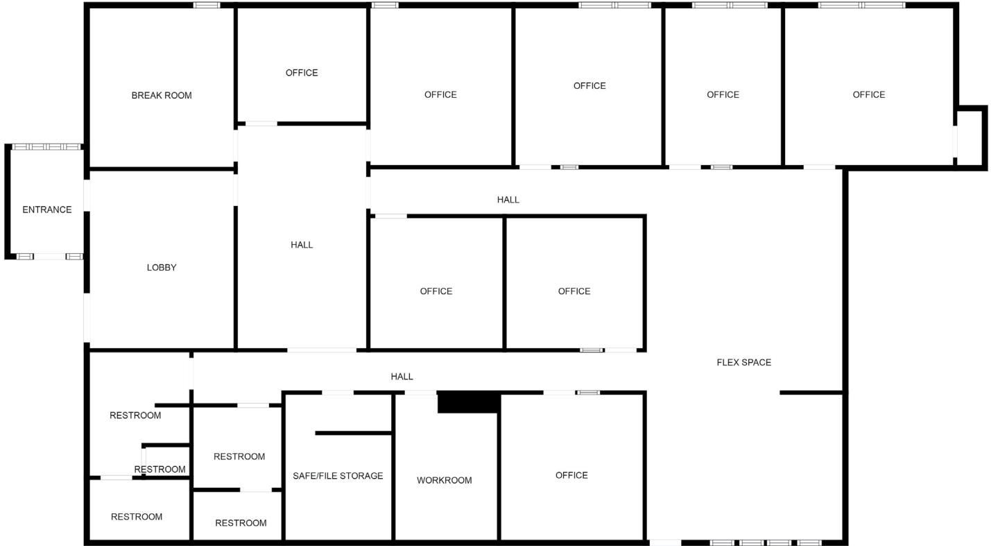
FLOOR PLAN CREATED BY CUBICASA APP. MEASUREMENTS DEEMED HIGHLY RELIABLE BUT NOT GUARANTEED.