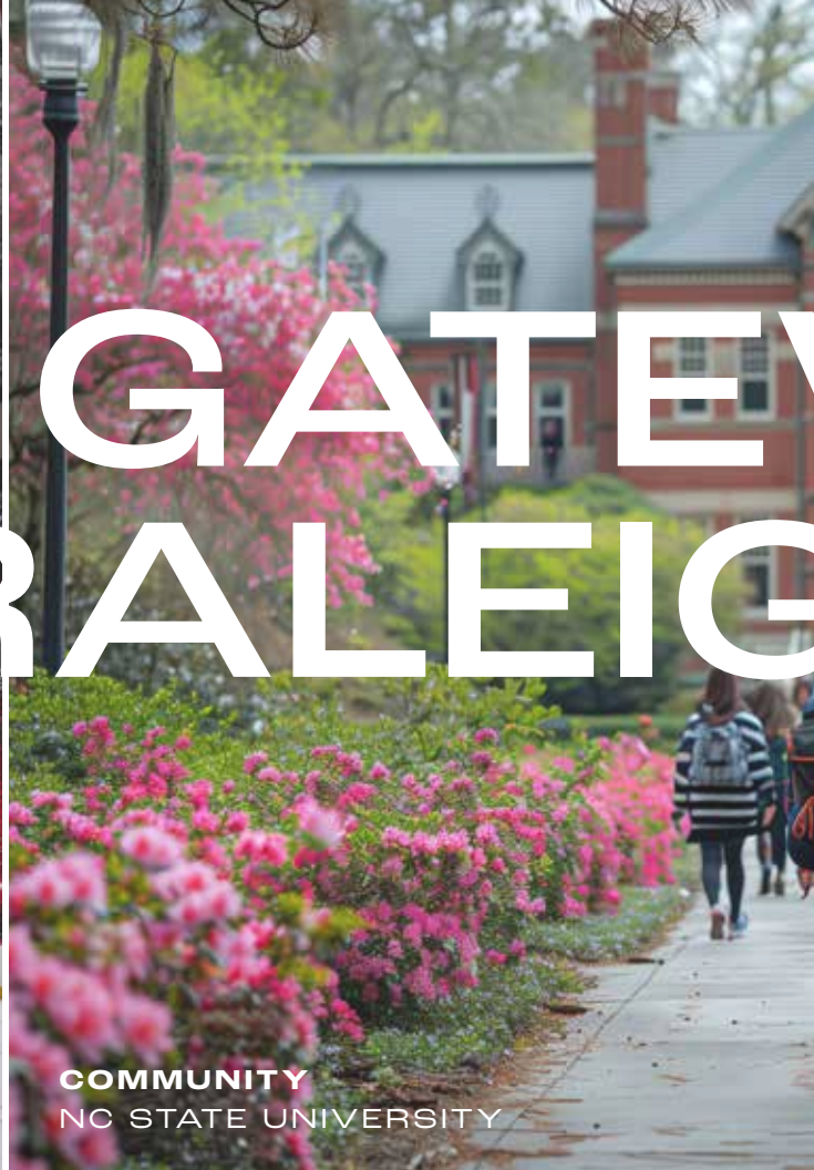
COMMUNITY NC STATE UNIVERSITY