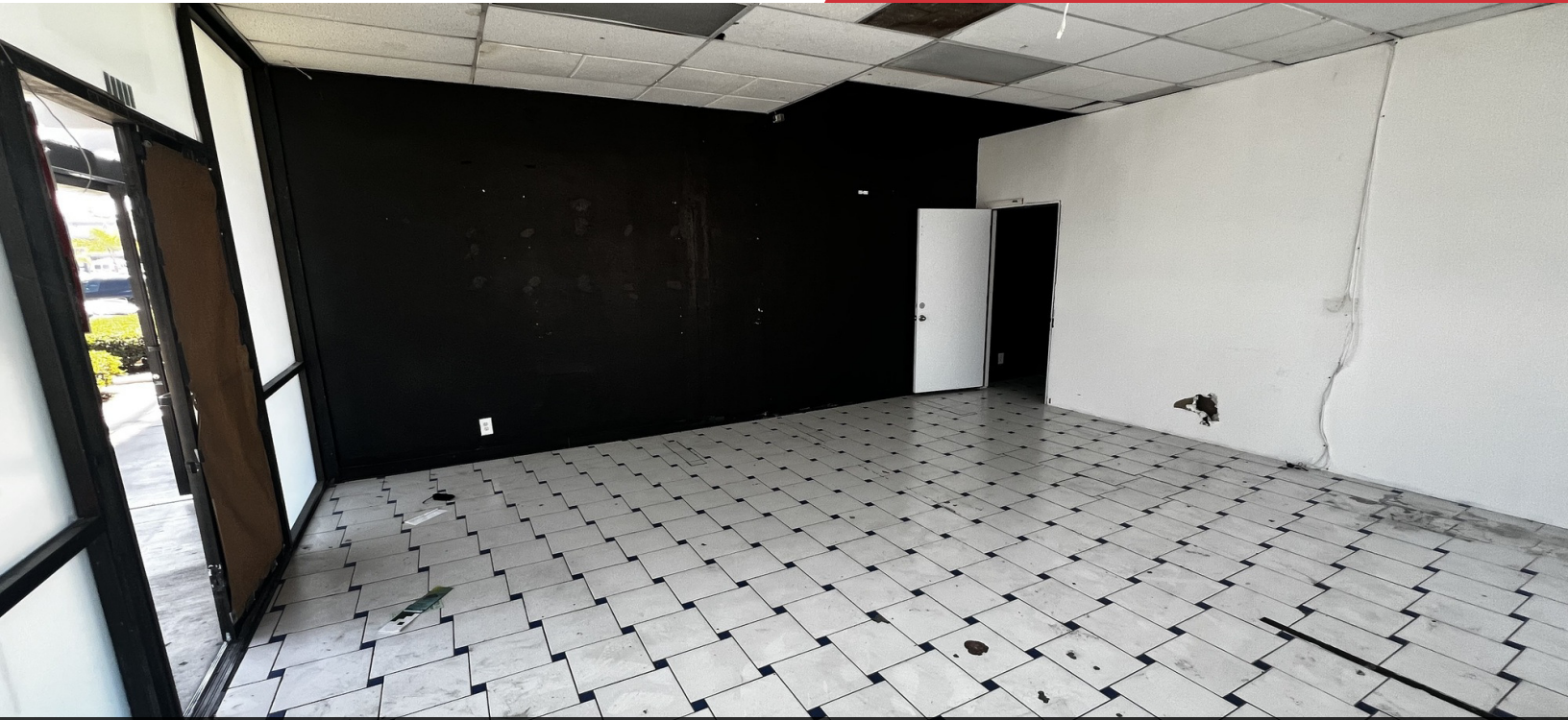
Endcap - Suite #24322