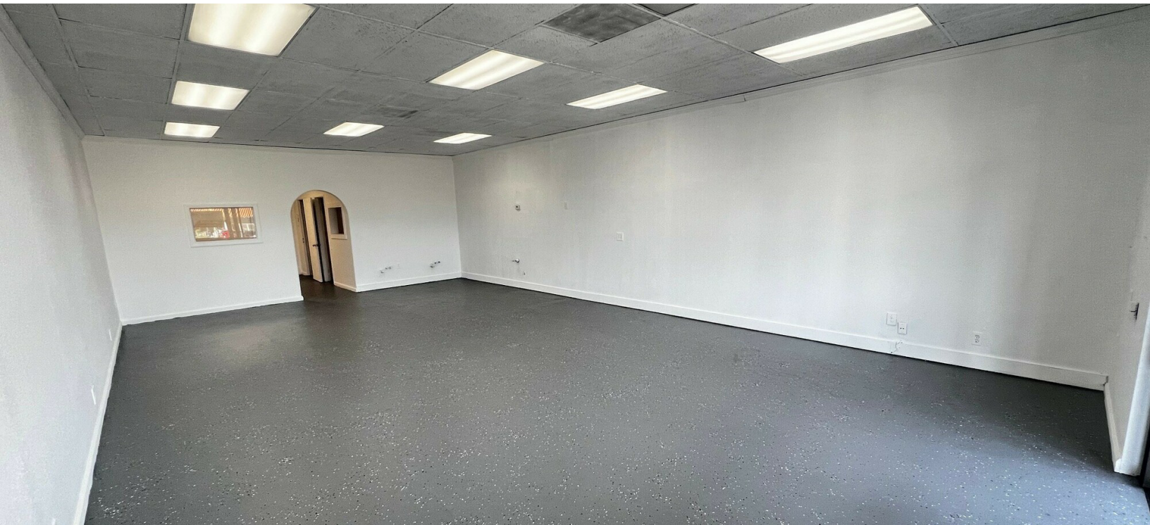
Inline - Suite #24344