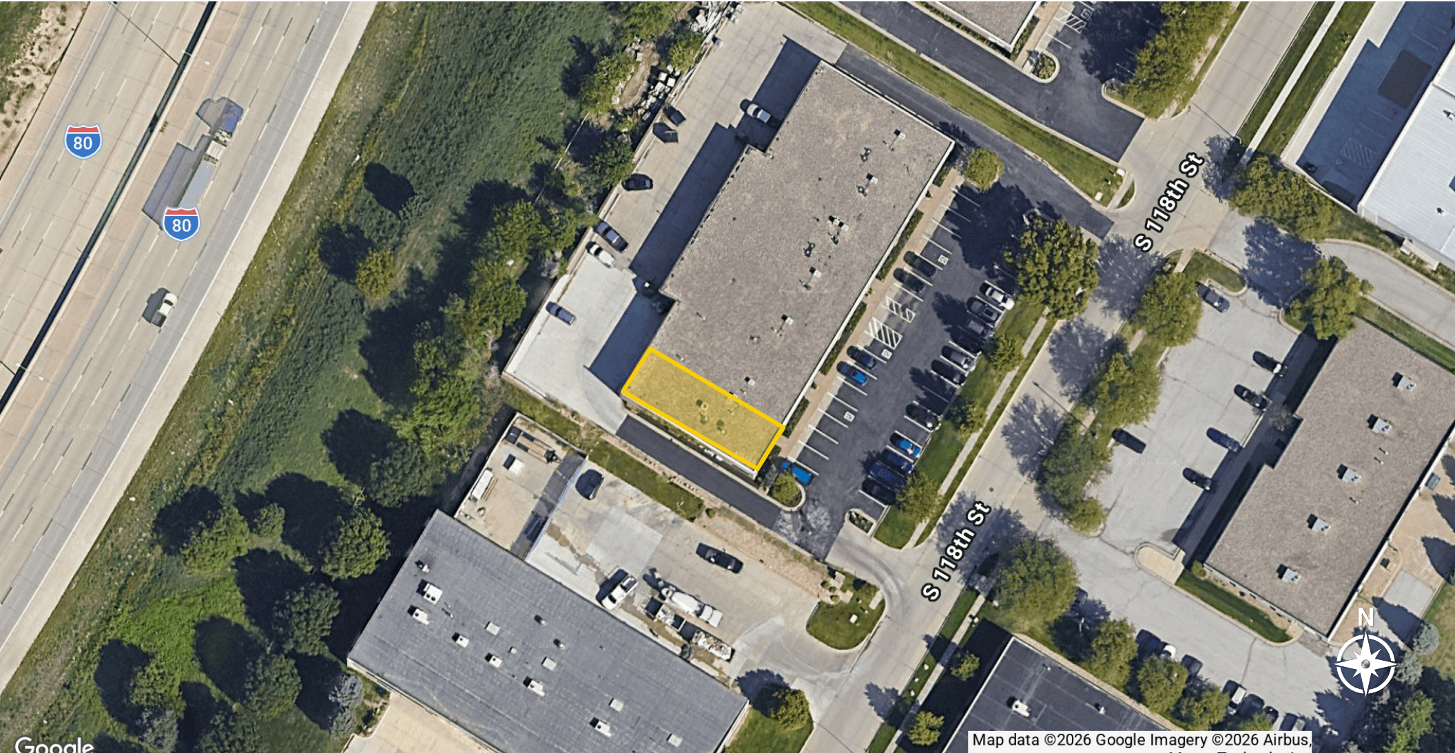
Map data ©2026 Google Imagery ©2026 Airbus,

Colten Adams colten@oak-ire.com 402.394.7300