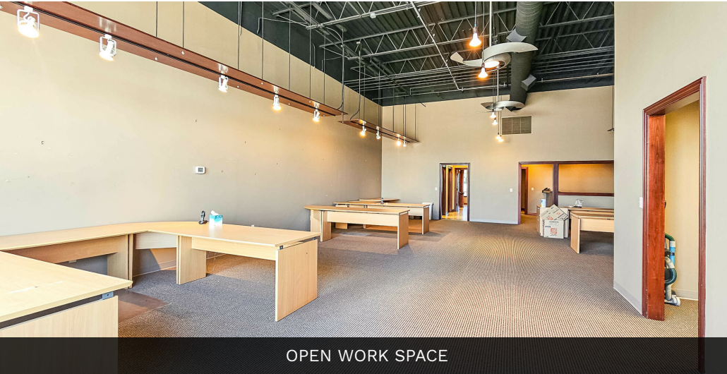
OPEN WORK SPACE