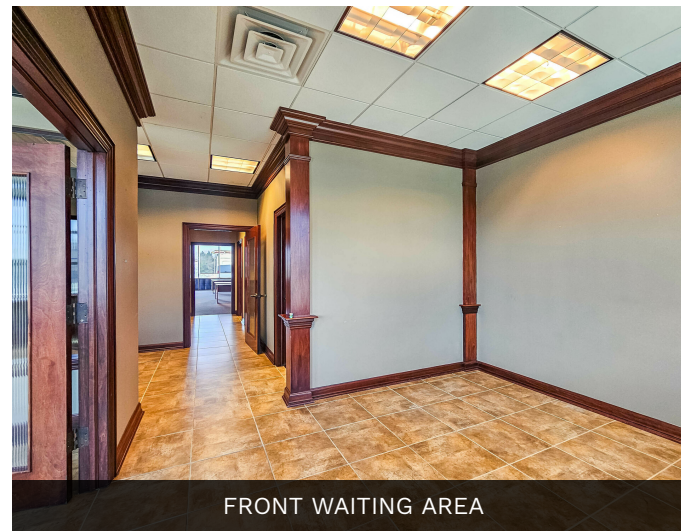
FRONT WAITING AREA