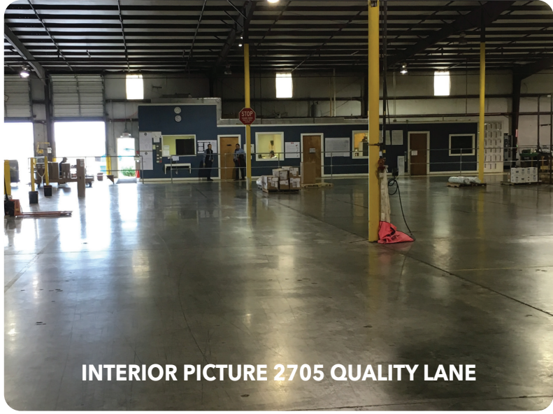
INTERIOR PICTURE 2705 QUALITY LANE

TO THE NORTH 16 +/- VACANT ACRES FOR EXPANSION, ADDITIONAL TRUCK PARKING, EMPLOYEE PARKING, OUTSIDE STORAGE OR BUILD TO SUIT.