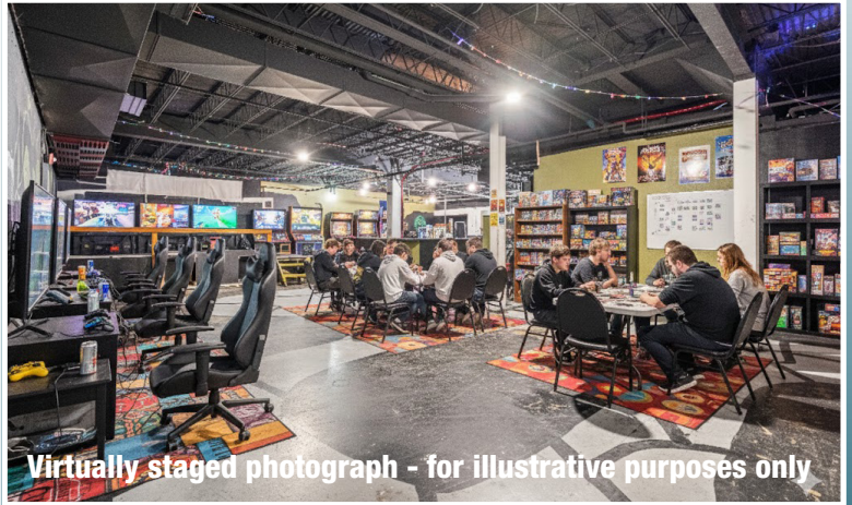
Virtually staged photograph - for illustrative purposes only