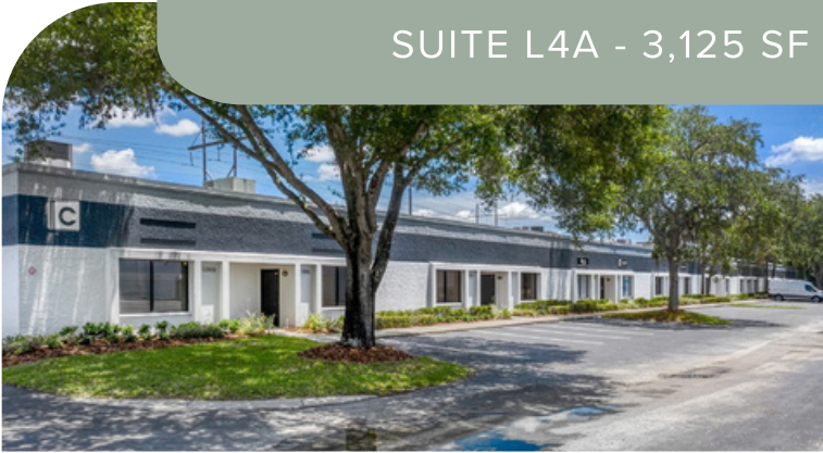
SUITE L4A - 3,125 SF

14130 MCCORMICK DRIVE, SUITE L4A | TAMPA, FL 33626