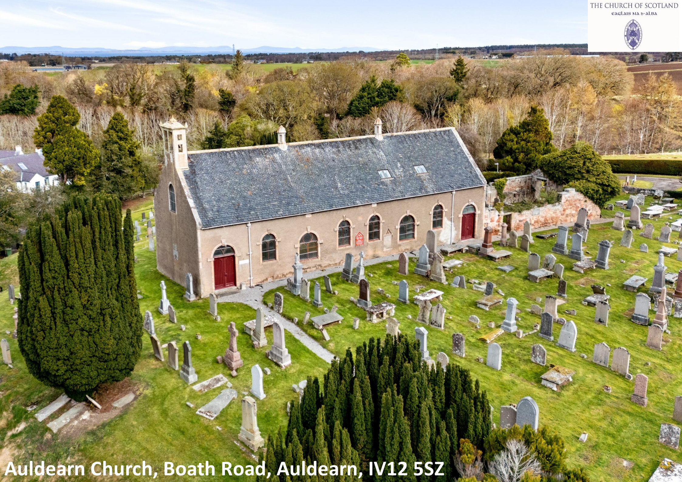
Auldearn Church, Boath Road, Auldearn, IV12 5SZ