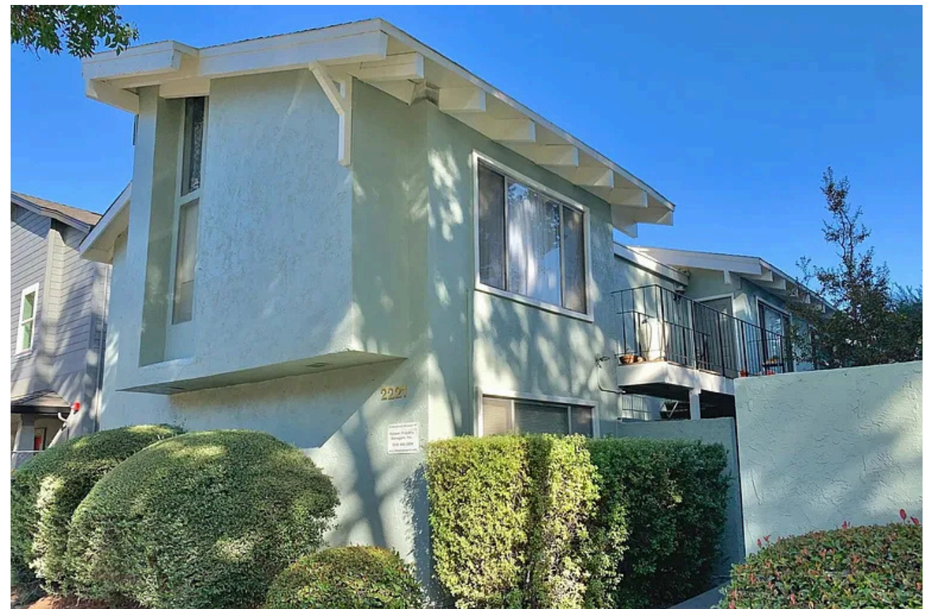
2221-23 Q Street