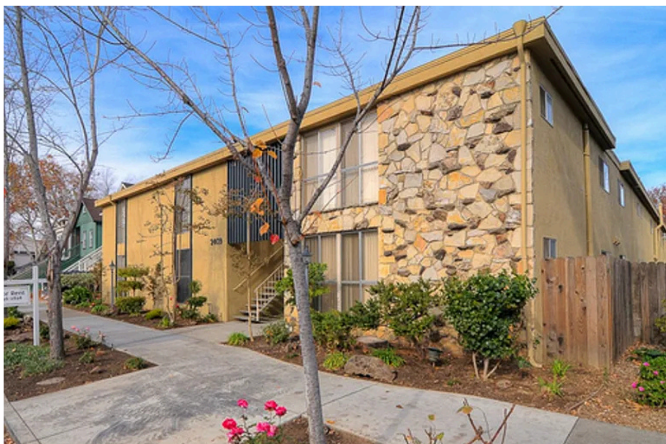
2409 Q Street