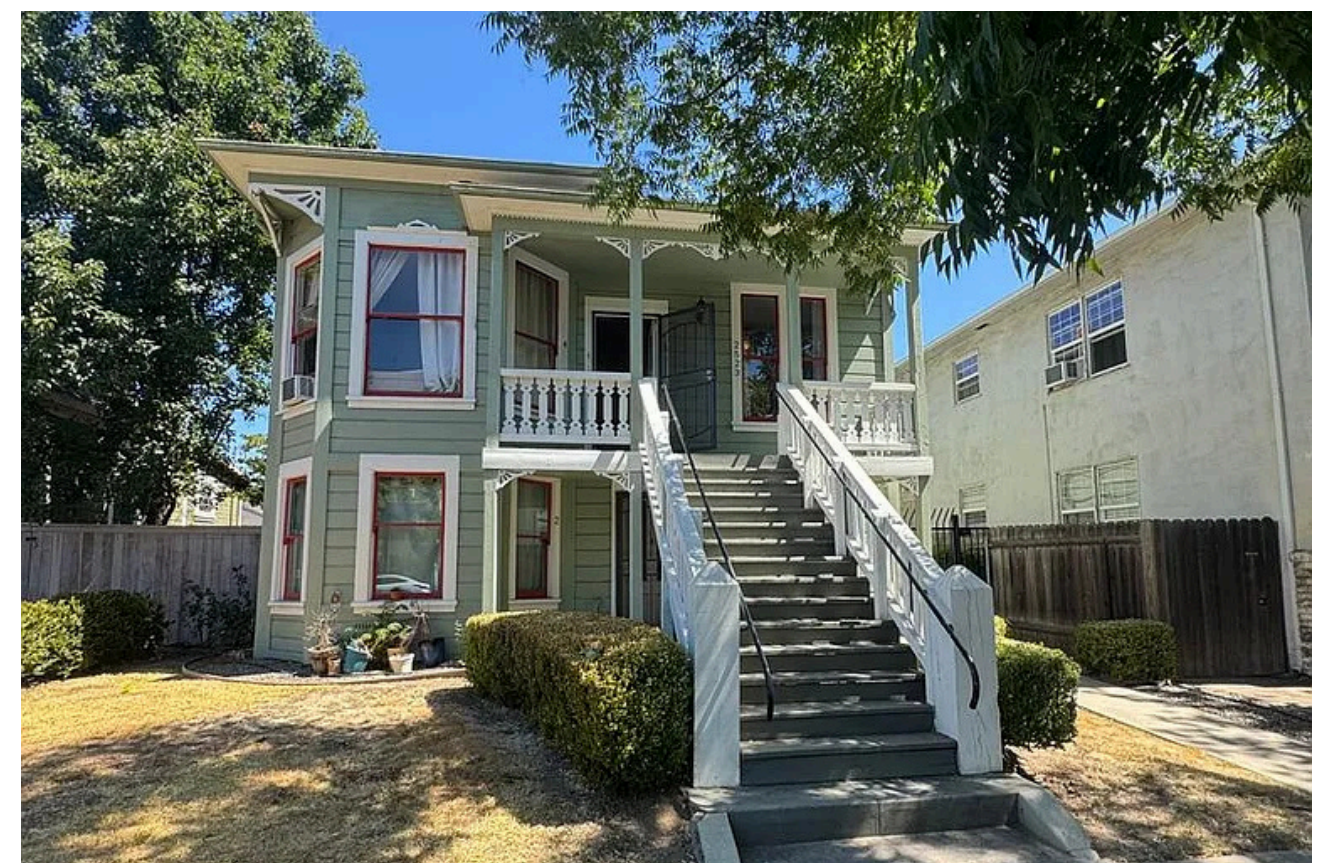
2523 P Street