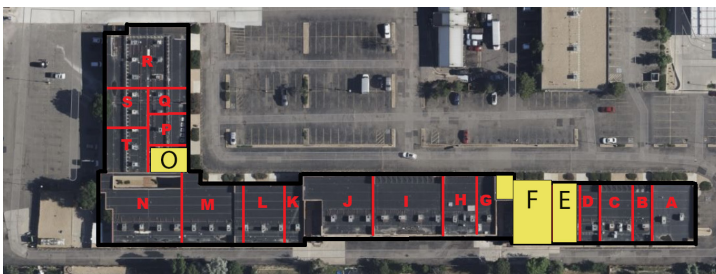
East Iliff Plaza