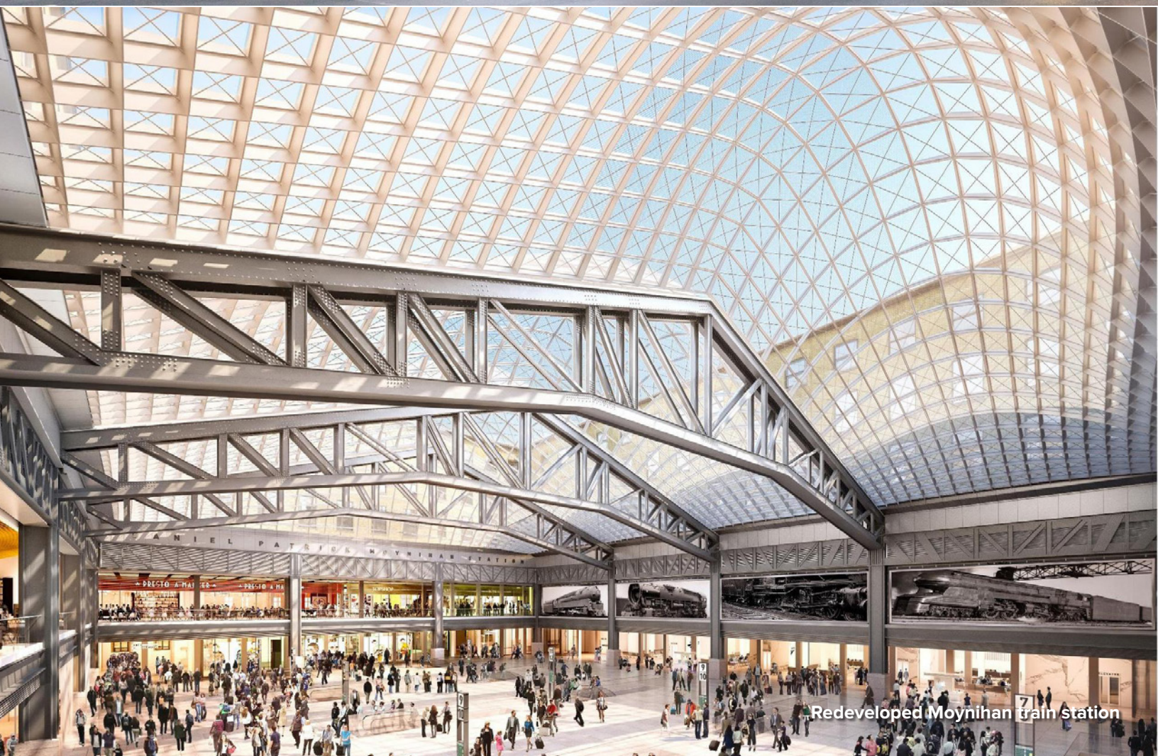
Redeveloped Moynihan train station