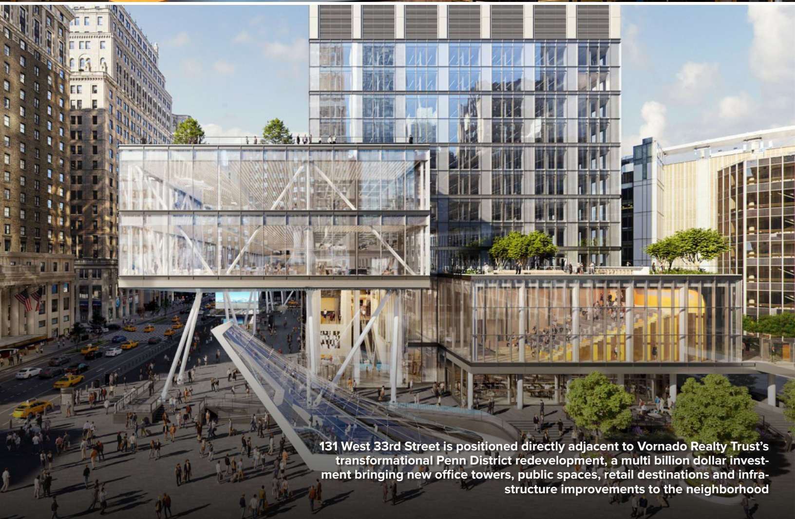
131 West 33rd Street is positioned directly adjacent to Vornado Realty Trust's transformational Penn District redevelopment, a multi billion dollar investment bringing new office towers, public spaces, retail destinations and infrastructure improvements to the neighborhood