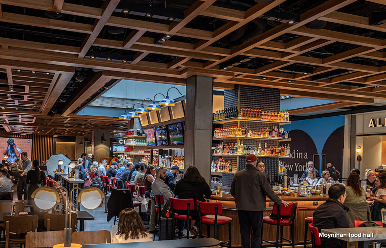
Moynihan food hall