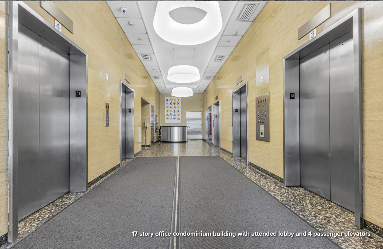
17-story office condominium building with attended lobby and 4 passenger elevators