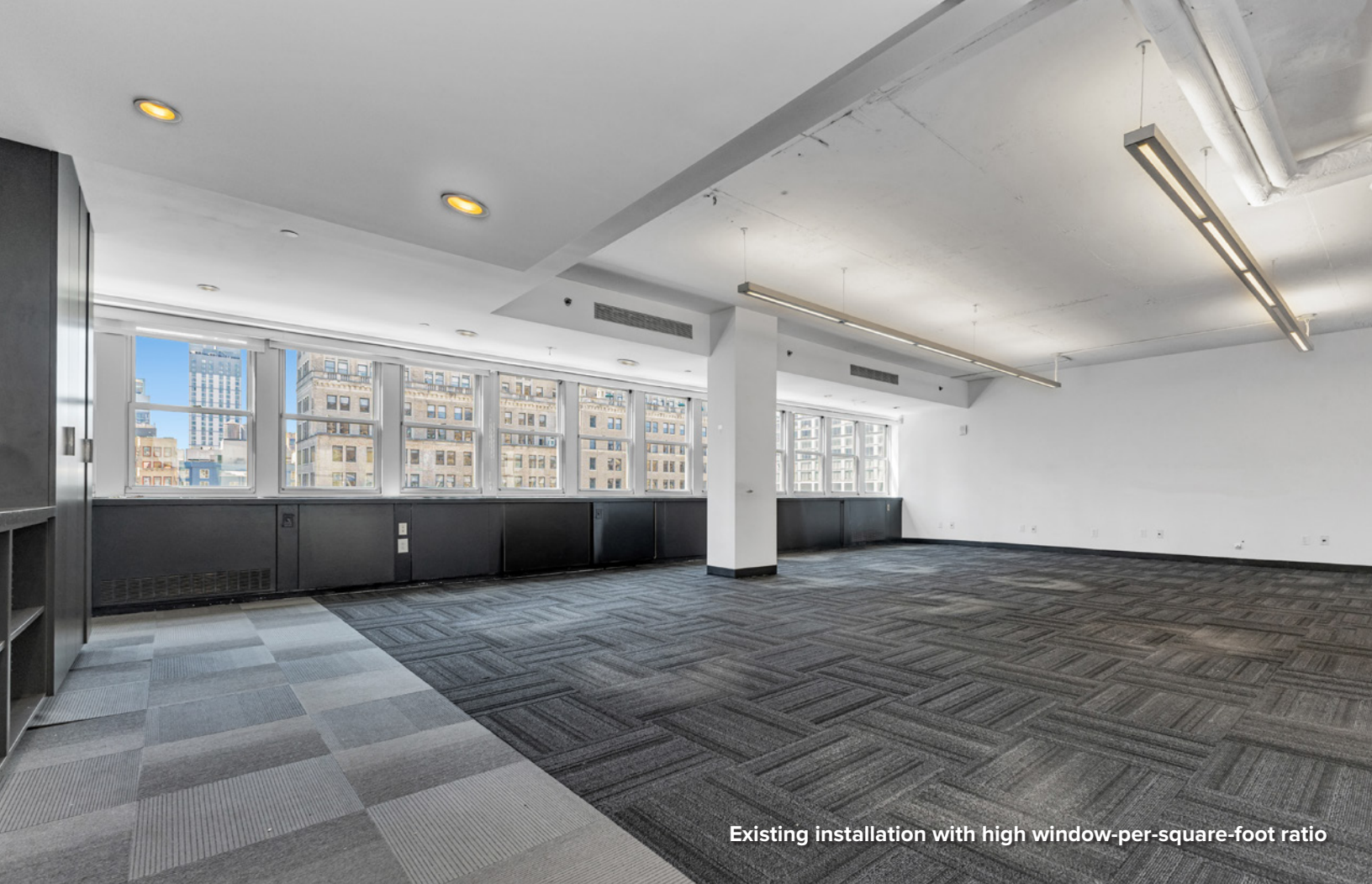
Existing installation with high window-per-square-foot ratio