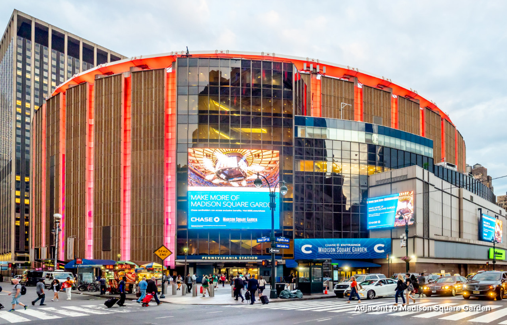
Adjacent to Madison Square Garden