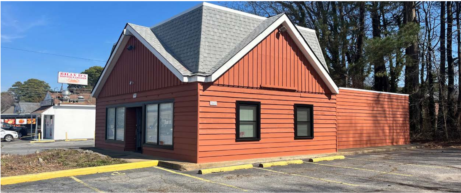
Office/Retail Building | 5680 Churchland Boulevard, Portsmouth, Virginia