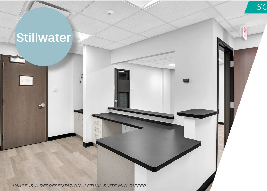
IMAGE IS A REPRESENTATION. ACTUAL SUITE MAY DIFFER.