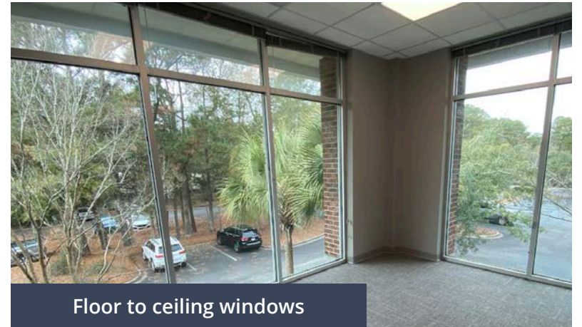
Floor to ceiling windows