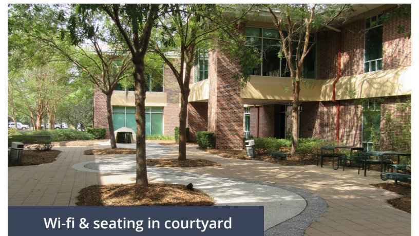
Wi-fi & seating in courtyard