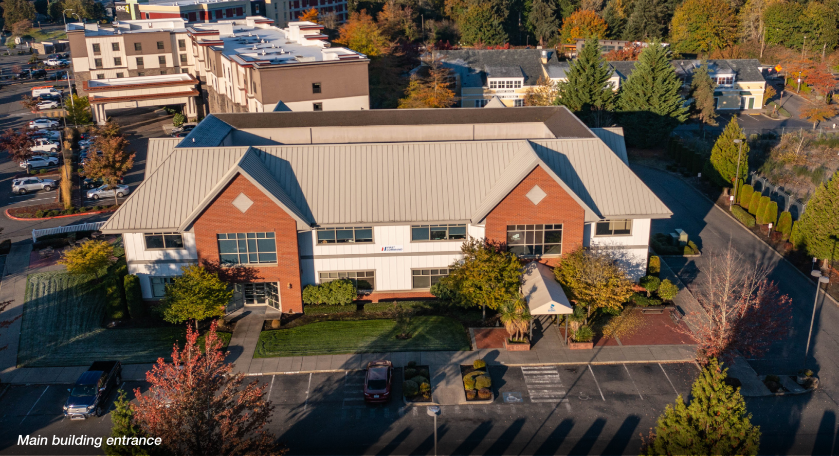
Main building entrance