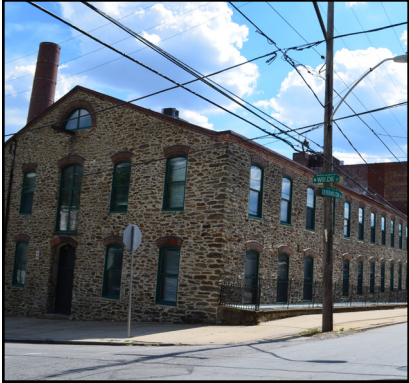
Table 14-701-4: Dimensional Standards for Industrial Districts