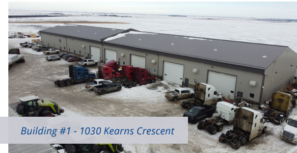
Building #1 - 1030 Kearns Crescent

Contact the listing agents for more information.