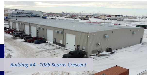
Building #4 - 1026 Kearns Crescent