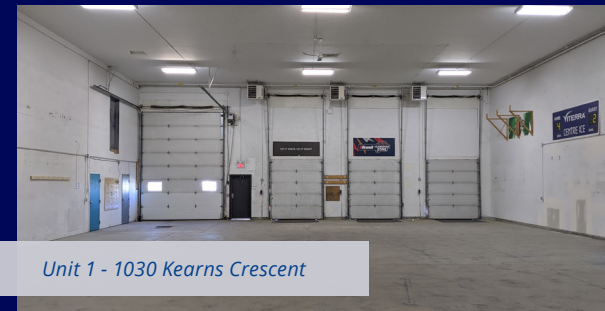
Unit 1 - 1030 Kearns Crescent