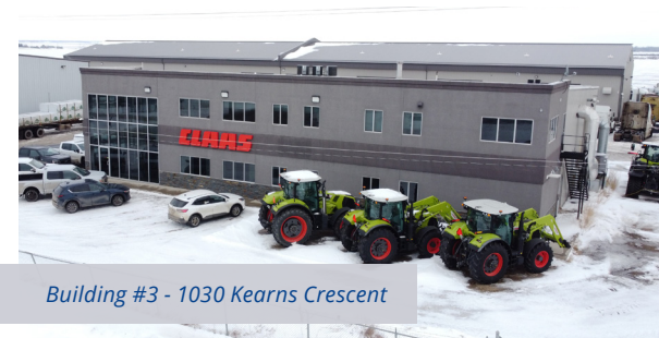
Building #3 - 1030 Kearns Crescent