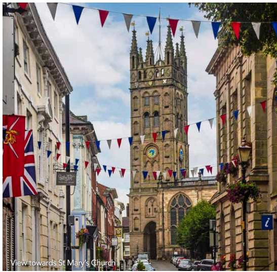
View towards St Mary's Church