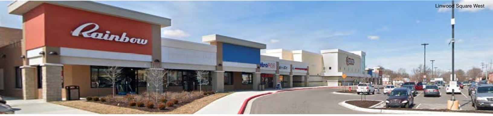
Linwood Square West