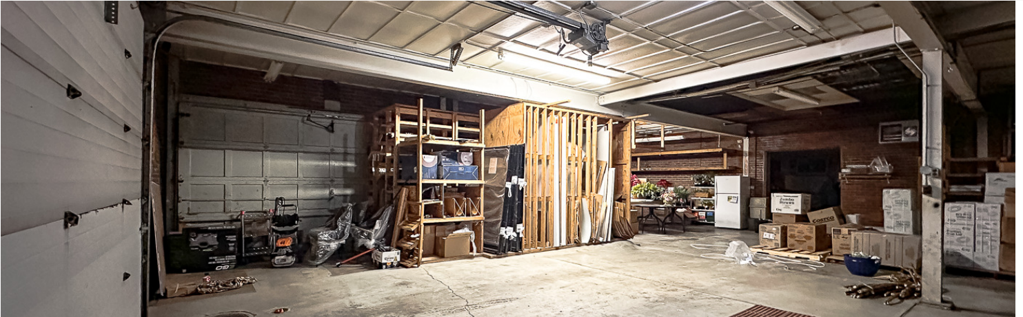
WAREHOUSE | 2,912 SF