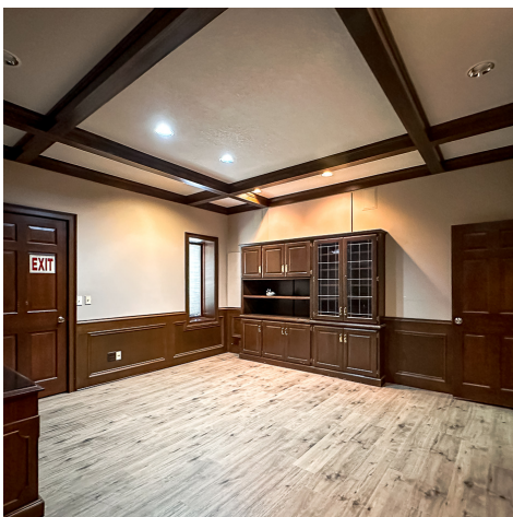
LARGE PRIVATE OFFICE