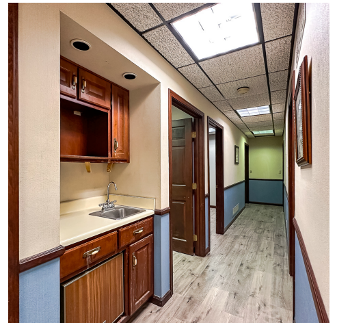
HALLWAY & SINK