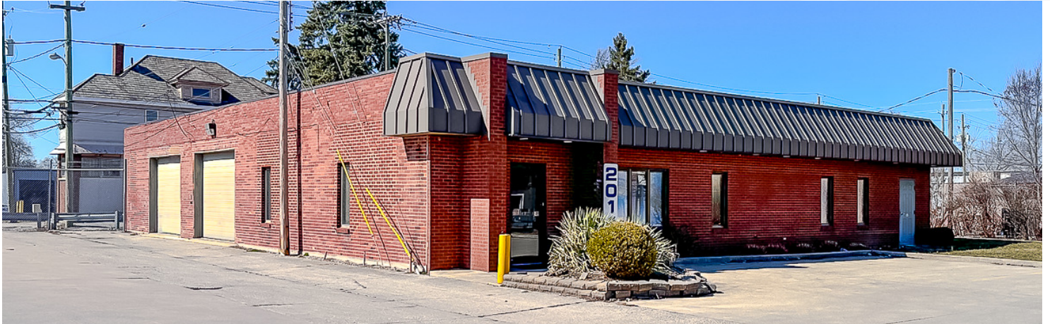
OFFICE | 2,145 SF