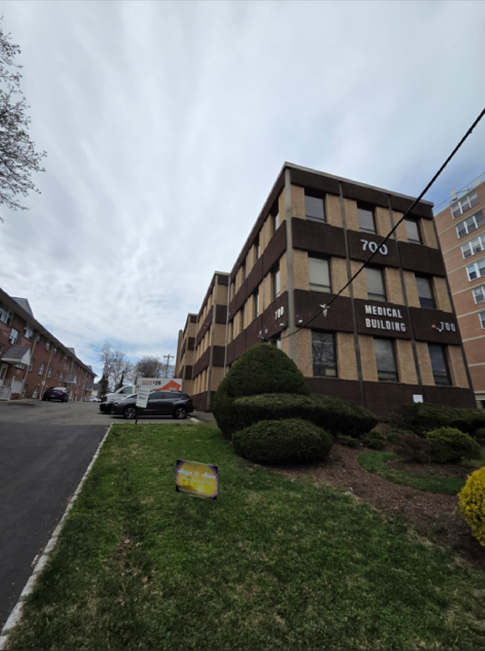
SITE PHOTO AS TAKEN ON 04.01.2026