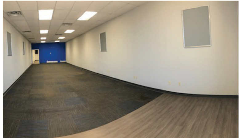
Front Carpeted Bay