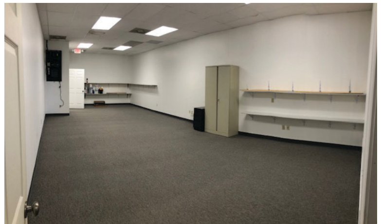
Rear Carpeted Bay