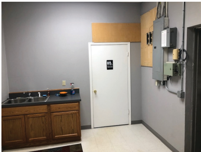
Rear Breakroom and Restroom