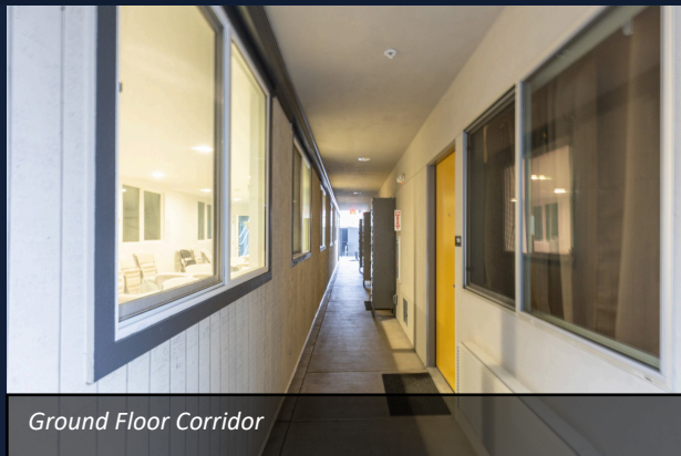
Ground Floor Corridor