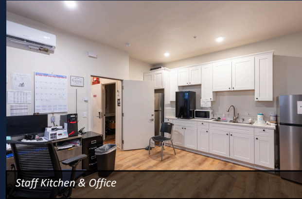
Staff Kitchen & Office