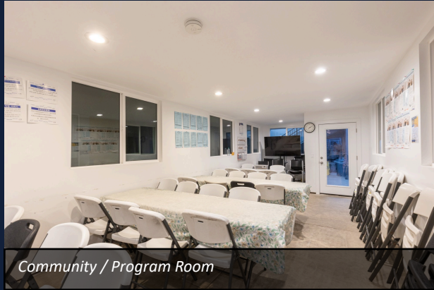
Community / Program Room