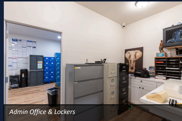
Admin Office & Lockers