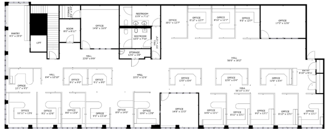
2 ND LEVEL | 5,722 SF