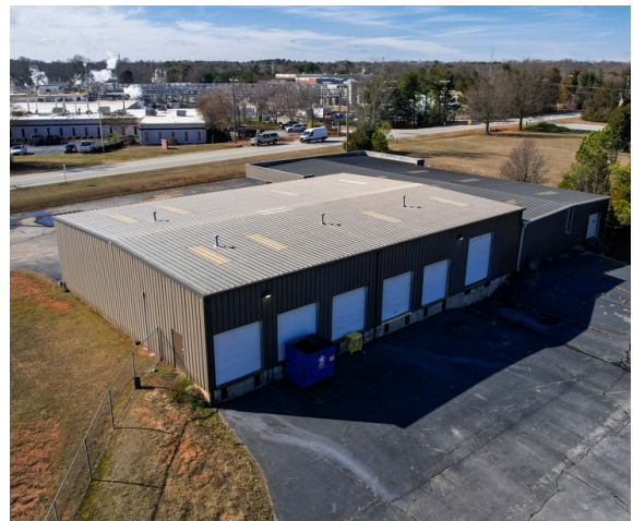
GREENVILLE COUNTY TAX MAP NO 0400010102400

864.729.4500 | PO BOX 9776, GREENVILLE, SC 29604