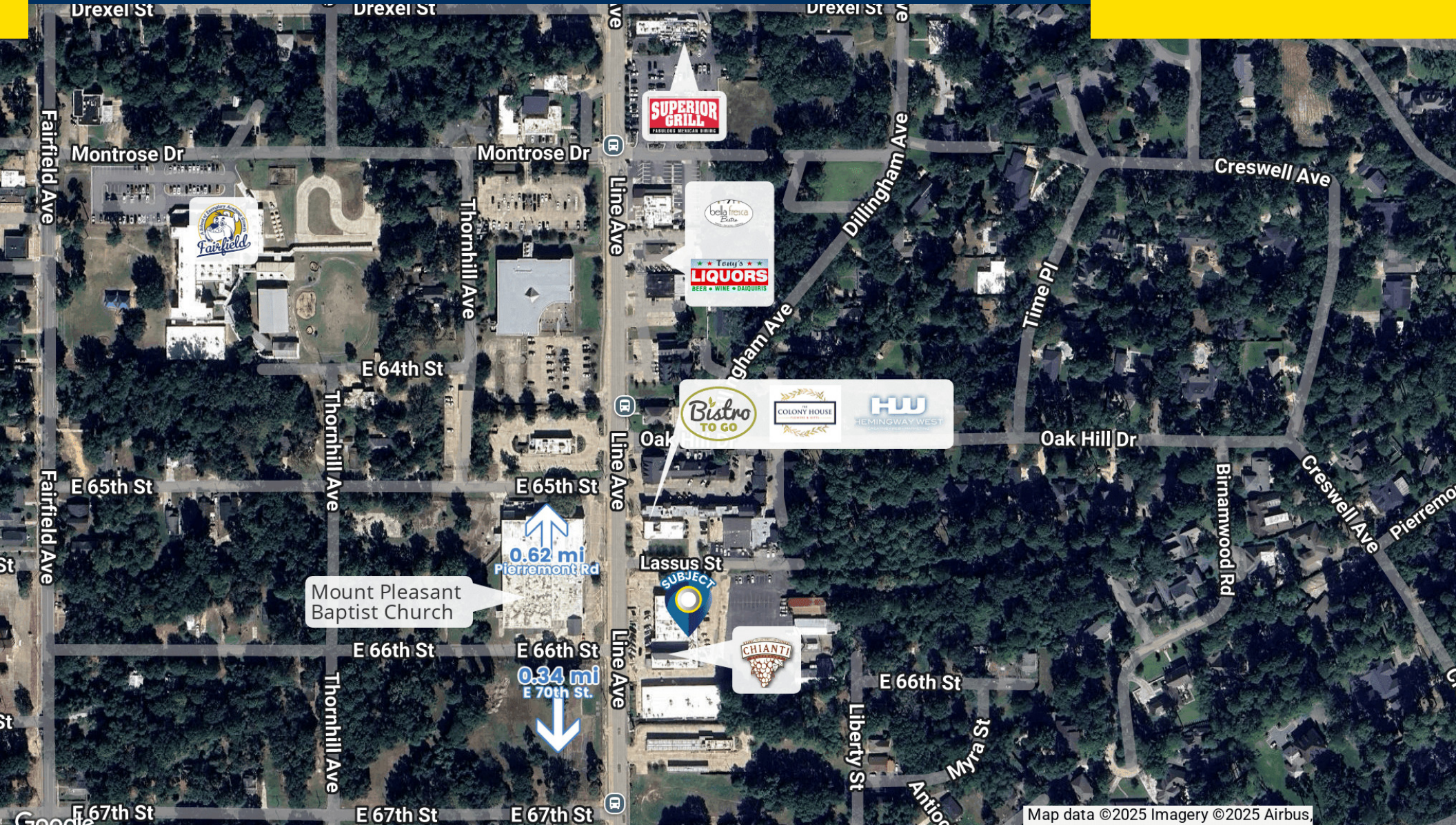
Map data ©2025 Imagery ©2025 Airbus

Sealy Real Estate Services 333 Texas Street, Suite 1050 Shreveport, LA 71101 318.222.8700 www.sealynet.com