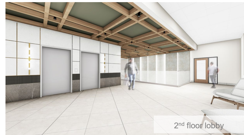
2 nd floor lobby