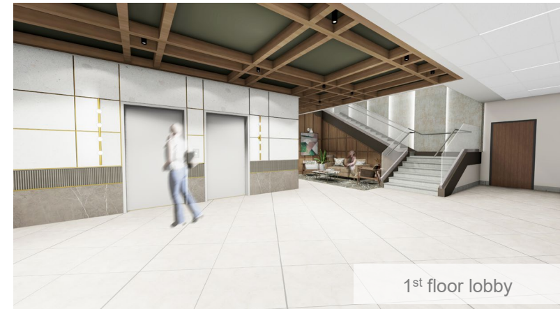
1 st floor lobby